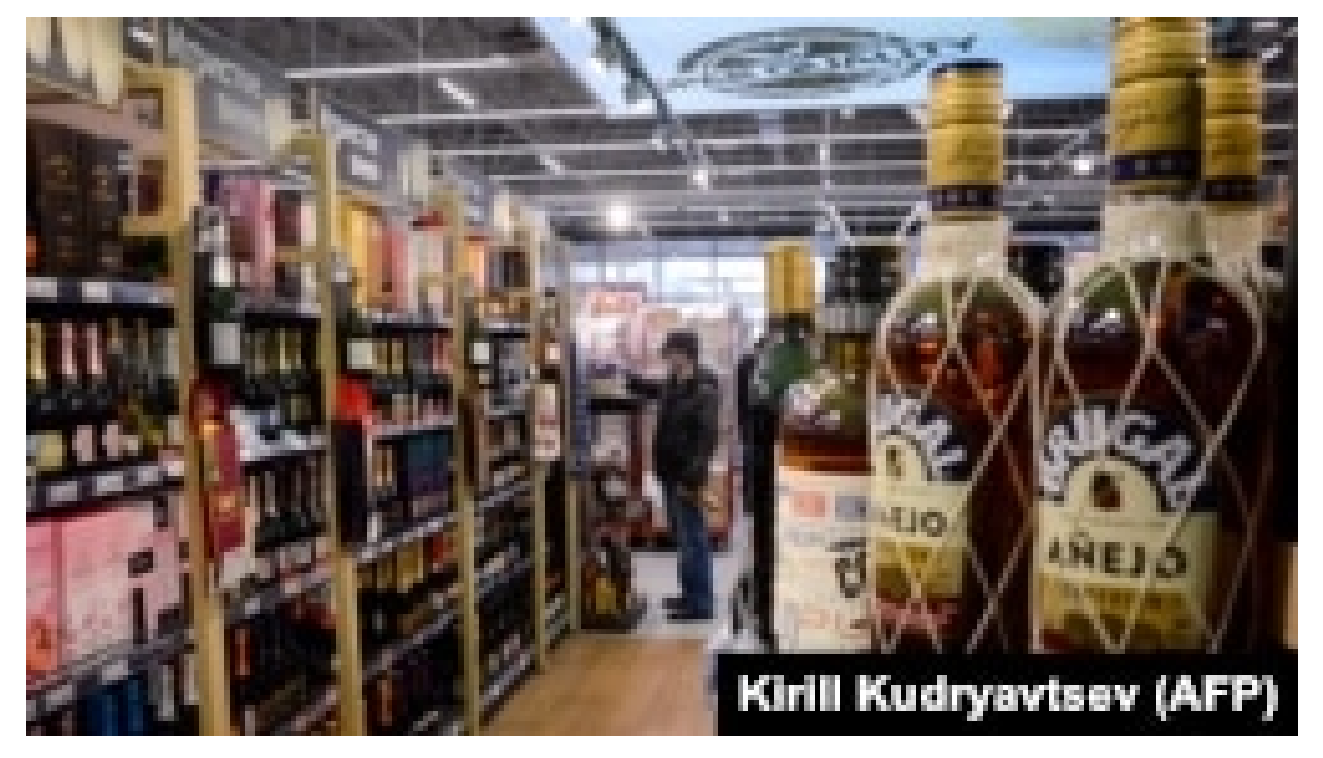
Russian authorities said that eight people died after they drank cider bought in local shops. (file photo)

Russia's Investigative Committee said on June 5 that eight people have died and several others have been hospitalized in the Ulyanovsk and Samara regions in the Volga federal district after they drank cider bought in local shops. Poisonings with surrogate alcohol are common in Russia as people look to save money on cheaper drinks. In 2021, 34 people were killed by surrogate alcohol in the Urals region of Orenburg. In December 2016, 78 people died in the Siberian region of Irkutsk after drinking a scented herbal bath oil, which contained methanol, a highly poisonous type of industrial alcohol. To read the original story by RFE/RL's Idel.Realities, click here.