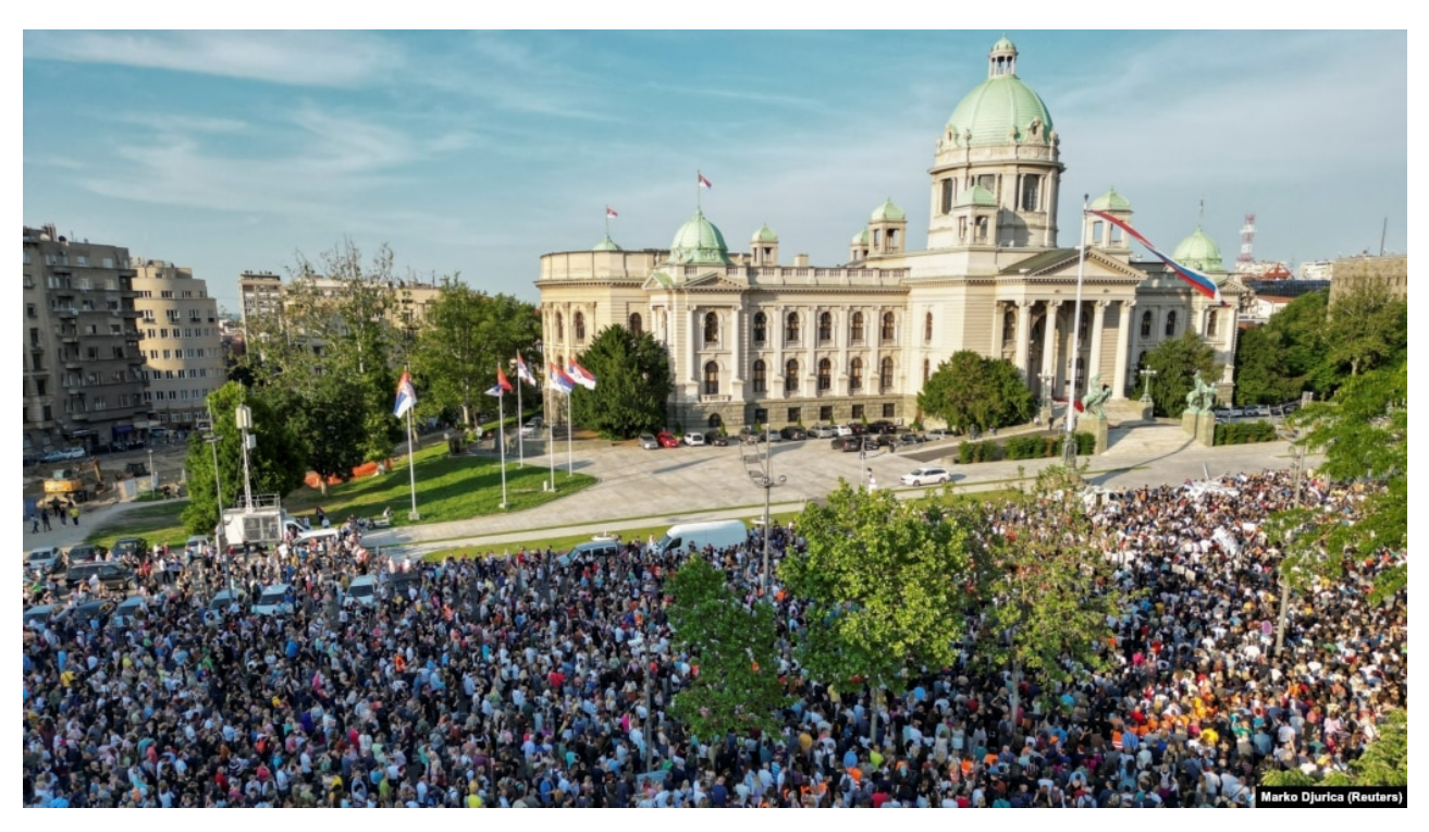
Lidé se účastní protestu srbských opozičních stran v reakci na dvě masové střelby ve stejném týdnu, 3. června v Bělehradě.

Irene Khan, zvláštní zpravodajka OSN pro svobodu názoru a projevu, vyjádřila znepokojení nad nárůstem nenávistných projevů v Srbsku po dvou incidentech s masovým zabíjením v této balkánské zemi. "Srbsko musí přijmout okamžitá a účinná opatření proti nenávistné a rozdělující rétorice ve veřejném diskurzu, která podněcuje násilí ve společnosti," stojí v prohlášení OSN. "Střelba traumatizovala celou zemi. Je nerozumné využít tuto tragédii jako další příležitost k podněcování nenávisti, démonizaci a hanění nezávislých médií, obránců lidských práv, politických odpůrců a dalších, kteří kritizují vládu. Chcete-li si přečíst původní příběh od RFE/RL Balkan Service, klikněte sem .