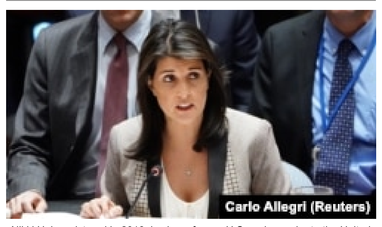
Nikki Haley, pictured in 2018, is also a former U.S. ambassador to the United Nations.

Nikki Haley, former South Carolina governor and 2024 Republican presidential candidate, said helping Ukraine defend itself from Russian aggression is in the U.S. national interest, breaking with leading party candidates Donald Trump and Ron DeSantis, who