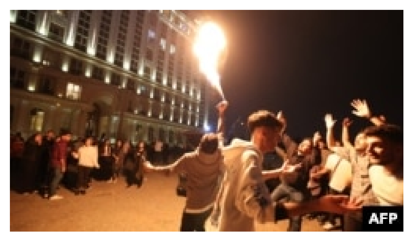
Iranians dance ahead of Nowruz, the Persian New Year, in Tehran on March 14. Dancing, a form of expression often suppressed by the government, has emerged as a symbolic act of civil disobedience.

A wave of public demonstrations has swept across Iran on the anniversary of the death of Ruhollah Khomeini, the founder of the Islamic republic, with Iranians dancing in the streets in a display of defiance of authority amid a crackdown on unrest that has swept the country.