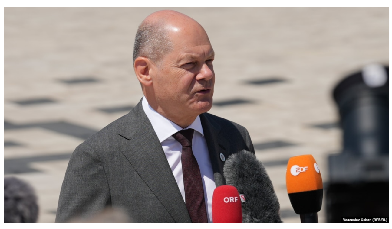
Německý kancléř Olaf Scholz (skladové foto)

Německý kancléř Olaf Scholz zuřivě obhajoval zaslání pomoci Ukrajině poté, co na něj demonstranti křičeli během projevu na shromáždění jeho strany ve Falkensee u Berlína. Demonstranti během Scholzova projevu 2. června vykřikovali fráze jako "warm štoláři" a "Vytvořit mír bez zbraní". křičí na něj. Scholz také dal jasně najevo, že nevidí žádnou alternativu k podpoře Ukrajiny, a to nejen v principu, ale také pomocí zbraní, vzhledem k rozsáhlé ruské invazi.