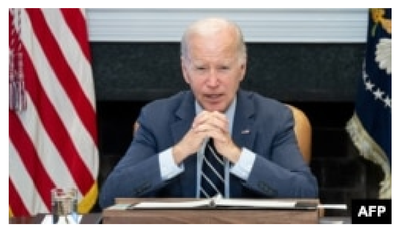
U.S. President Joe Biden makes an address on June 5.

U.S. President Joe Biden thanked Prime Minister Mette Frederiksen on June 5 for Denmark's role in a Western alliance "standing up" for Ukraine as it tries to fend off Russia's 15-month-old invasion. The Oval Office visit kicked off the first of a pair of critical meetings Biden is holding with European allies this week that will focus heavily on what lies ahead in the war in Ukraine -- including the recently launched effort to train, and eventually equip, Ukraine with Americanmade F-16s fighter jets. Biden on June 7 will meet with British Prime Minister Rishi Sunak. To read the original story by AP, click <u>here</u>.