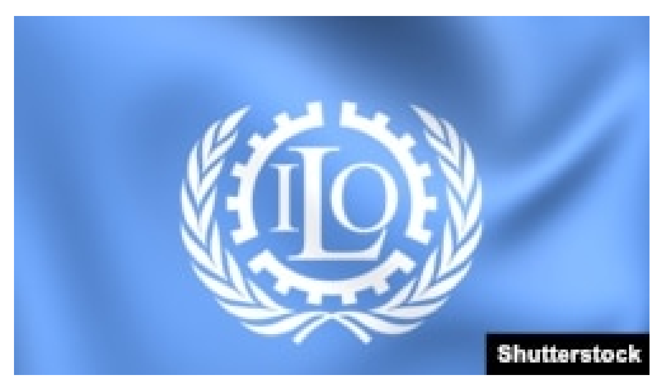
The logo of the International Labor Organization

Eight independent labor organizations in Iran have called for the expulsion of the country from the International Labor Organization (ILO) and its session in Switzerland that starts on June 5.