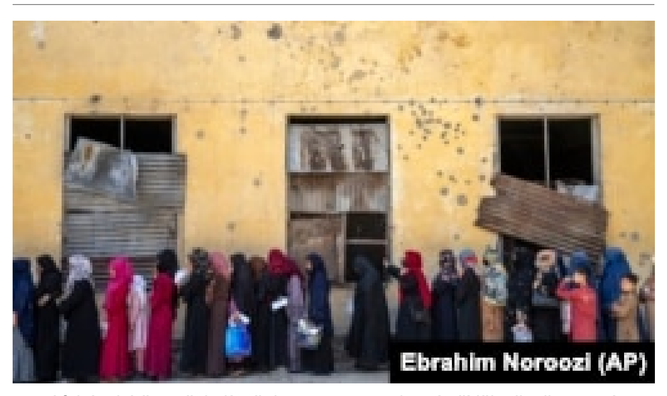
Afghánské ženy čekají, až dostanou potravinové příděly distribuované skupinou humanitární pomoci v Kábulu v Afghánistánu koncem minulého měsíce.

Organizace spojených národů a humanitární agentury revidovaly rozpočet pro plán pomoci Afghánistánu na rok 2023 na 3,2 miliardy dolarů, což je pokles ze 4,6 miliardy dolarů na začátku roku, uvedl humanitární úřad OSN 5. června.