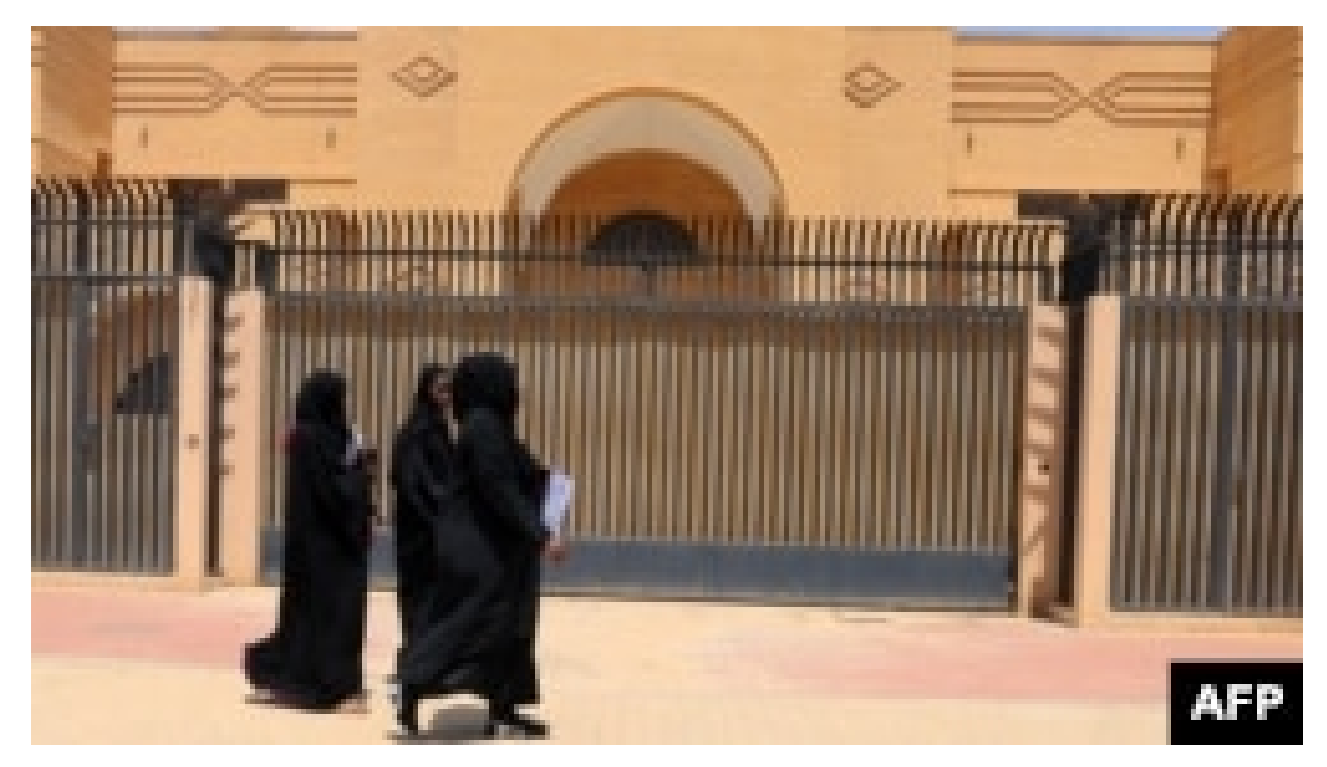
Women walk past the Iranian embassy in Riyadh, which will reopen on June 6. (file photo)

Iran will reopen its embassy in Saudi Arabia's capital on June 6, Iranian sources told the semiofficial Fars news agency, months after Tehran and Riyadh agreed to end years of hostility. In March, Iran and Saudi Arabia agreed to reestablish relations after years of hostility between the regional rivals that had threatened stability and security in the Middle East and helped fuel regional conflicts from Yemen to Syria. To read the original story by Reuters, click here .