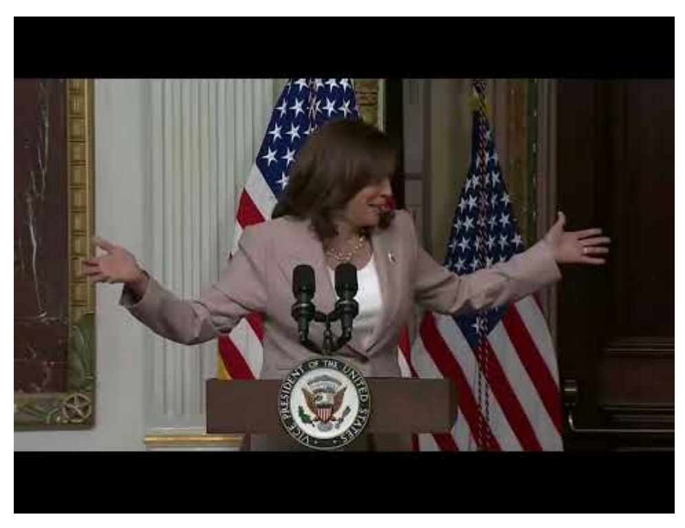
Watch Video At: https://youtu.be/2JWR29RT5sw

Here is a perfect example from a true Californian of color: