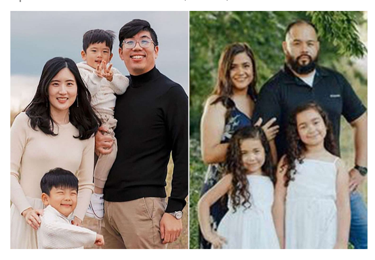
Toto jsou oběti střelby v Texas Mall

Studie s názvem Léky na předpis spojené s hlášeními o násilí vůči ostatním... prohlásila... V 69měsíčním sledovaném období jsme identifikovali 484 hodnotitelných léků, které představovaly 780 169 hlášení závažných nežádoucích účinků všeho druhu.... Případy násilí zahrnovaly 387 zpráv o vraždě, 404 fyzických útoků, 27 případů naznačujících fyzické týrání, 896 zpráv o vražedných představách a 223 případů popsaných jako symptomy související s násilím. "Psychiatrické drogy a vedlejší účinky – nespatřená ruka za násilím v Americe", Občanská komise pro lidská práva