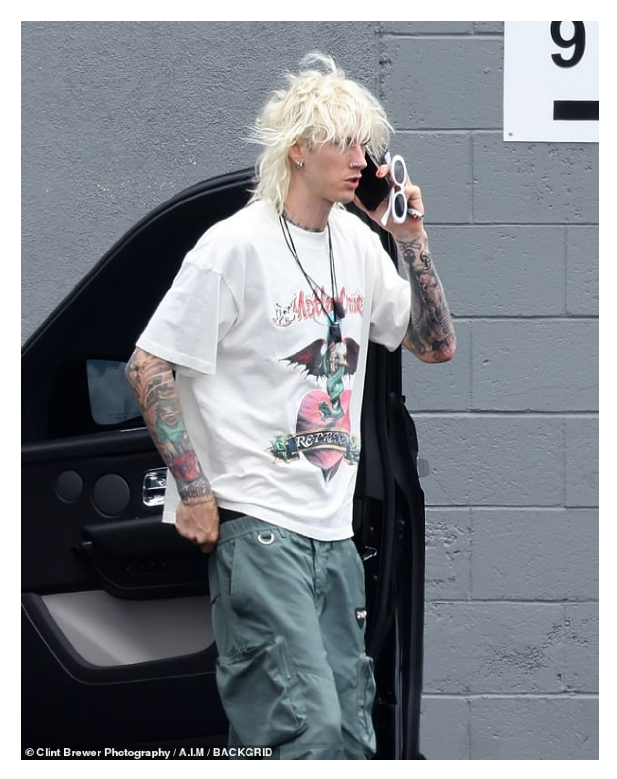
ReplyAgree/Disagree/Etc. This Commenter This Thread Hide Thread