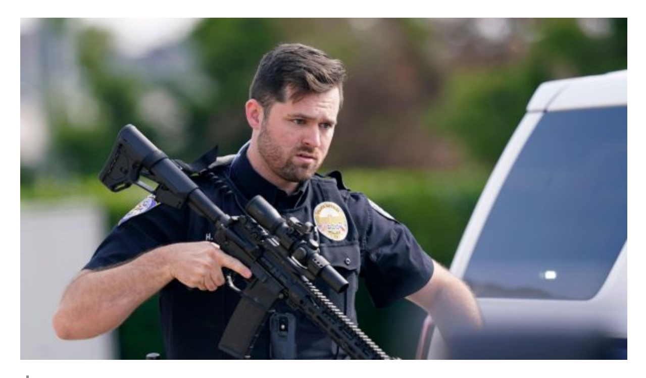
"Psychiatrická léčba a psychiatrické léky jsou společným jmenovatelem rostoucího počtu střeleb a jiných násilných činů, které prudce rostou spolu s prudkým předepisováním psychofarmak." <u>Killers on Psych Drugs</u>