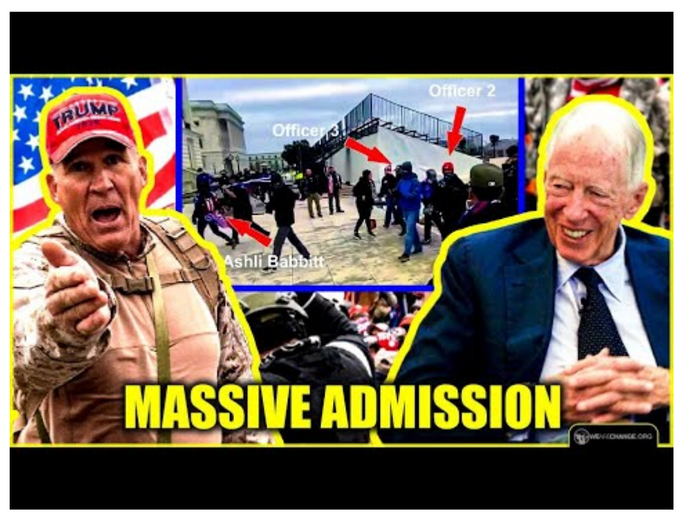
Watch Video At: https://youtu.be/5wYRahoEwVw