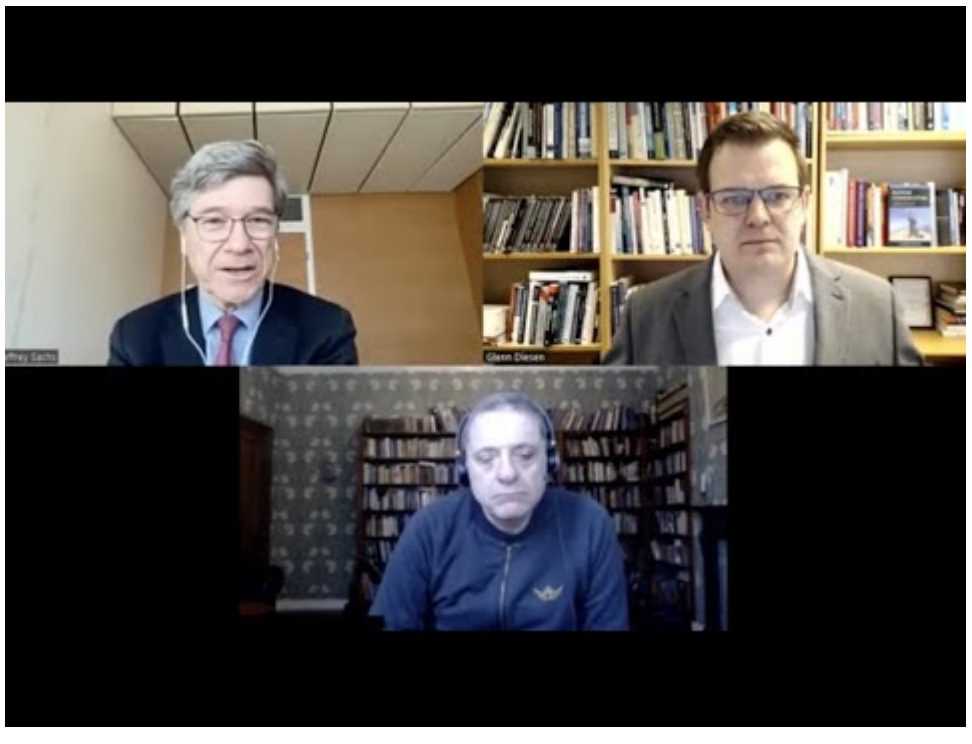
Watch Video At: https://youtu.be/DMQ6mqUS3qs

<u>March 27, 2023 at 6:35 pm GMT • 4.8 days ago</u> \uparrow Is unipolarity really fading?