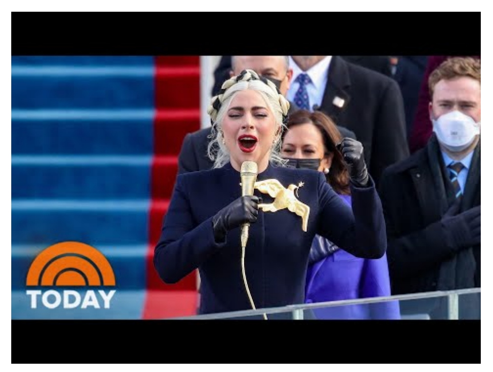
Watch Video At: https://youtu.be/HezPdHTwdGA