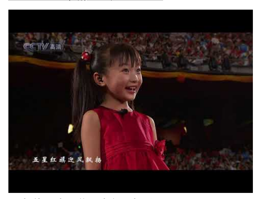
Watch Video At: https://youtu.be/W2UnbvJn8no