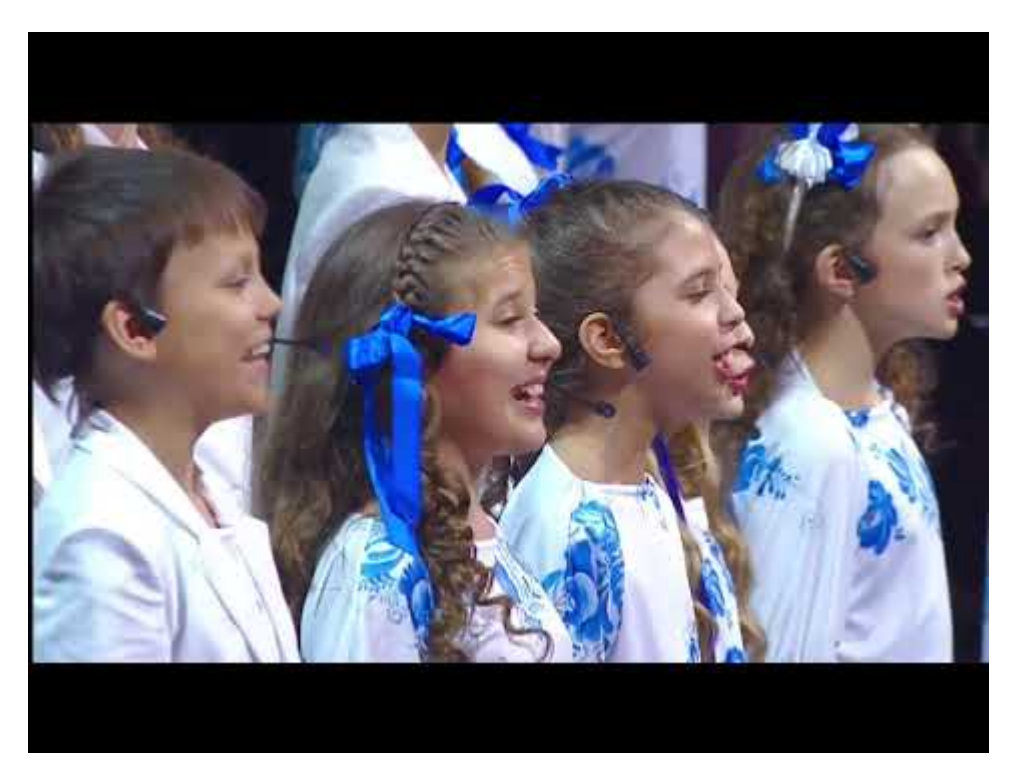
Watch Video At: https://youtu.be/VJcnuZB4Xt4

In case you haven't noticed, Eurasia is reuniting under Sino-Russian leadership. It won't be a recapitulation of the old Mongolian Empire but the boundaries will be much the same. And if India and China bury the hatchet (and I predict they will) Genghis Khan will be laughing in his grave... and a United Eurasia can and will give the middle finger to the militaristic, angry, confused, overweight, indebted, drug addicted and divided Judeo-Faggot-Tranny-Redneck America.