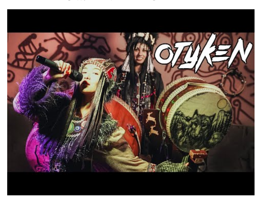
Watch Video At: https://youtu.be/59 HQRrik9Q