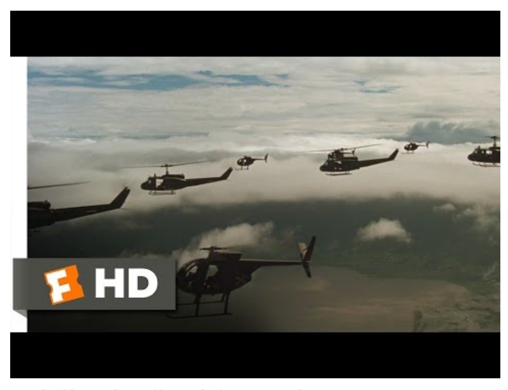
Watch Video At: https://youtu.be/3oQzJKCUekQ