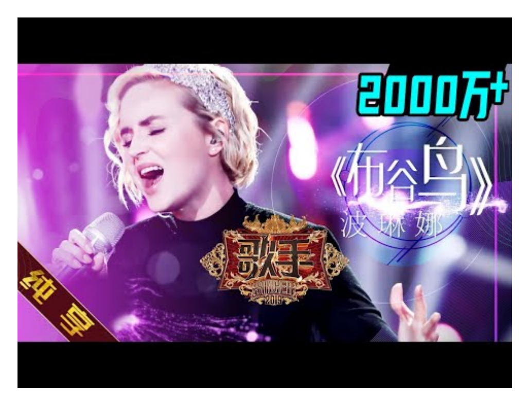
Watch Video At: https://youtu.be/T1Co32bmmRw