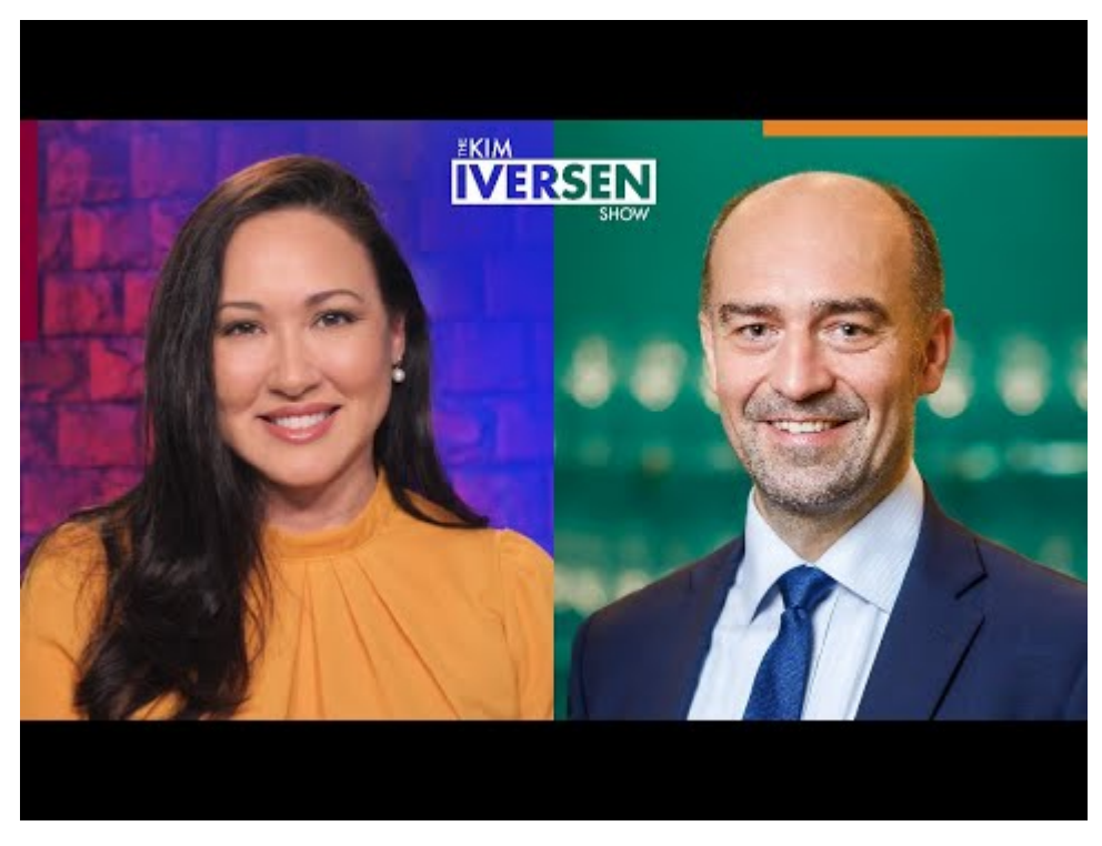
Watch Video At: https://youtu.be/FFAbK2orXao