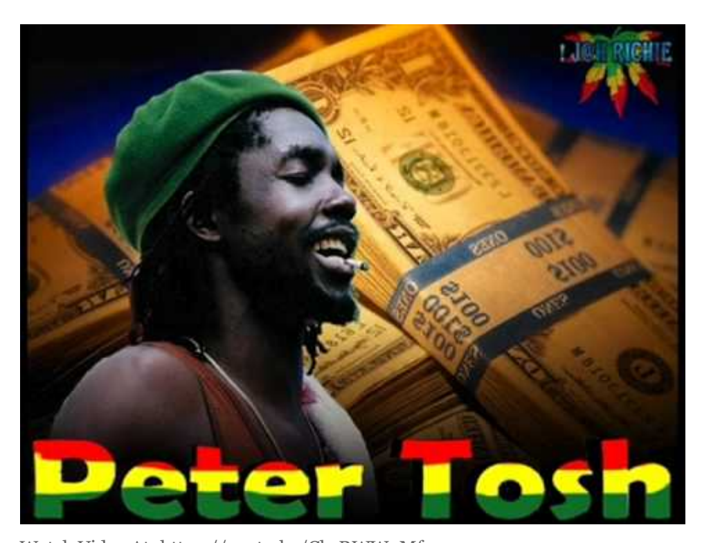
Watch Video At: https://youtu.be/CbsRWW4Mfu0

The day the dollar die, It's gonna be nice The day this here dollar die, There be no more inflation The day the dollar die ... We will love each other