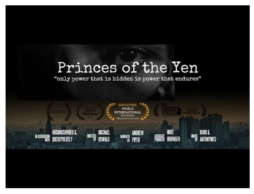
Watch Video At: https://youtu.be/p5Ac7ap MAY