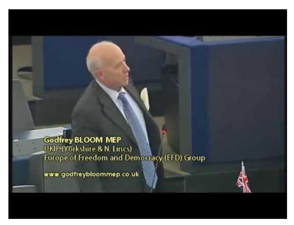
Watch Video At: https://youtu.be/hYzX3YZoMrs

Godfrey Bloom MEP • European Parliament, Strasbourg, 21 May 2013 • Speaker: Godfrey Bloom MEP, UKIP (Yorkshire & Lincolnshire)