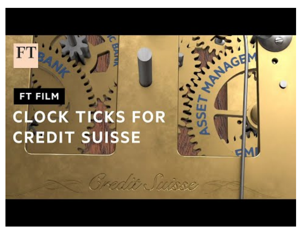
Watch Video At: https://youtu.be/PyuUc74Qdzs

Credit Suisse has been a criminal or at least a disreputable enterprise for quite some time depending on how you perceive criminality.