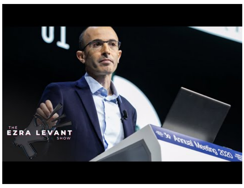
Watch Video At: https://youtu.be/d9z86ShYqNw

Here's how the same bunch of Marxist-Zionist scum did the covid/"vaccine" scam: