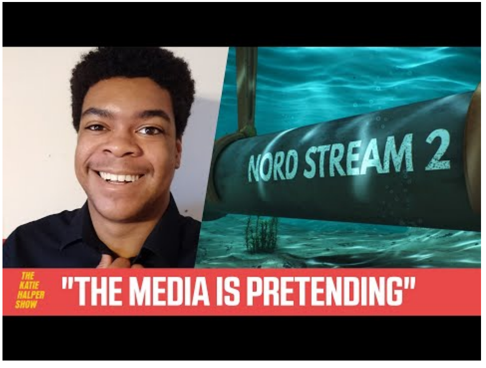
Watch Video At: https://youtu.be/VOUzZotBoCw

A Negro done laugh at NY Times story of who done blow up da Nord Stream.... sheeeeiiit.