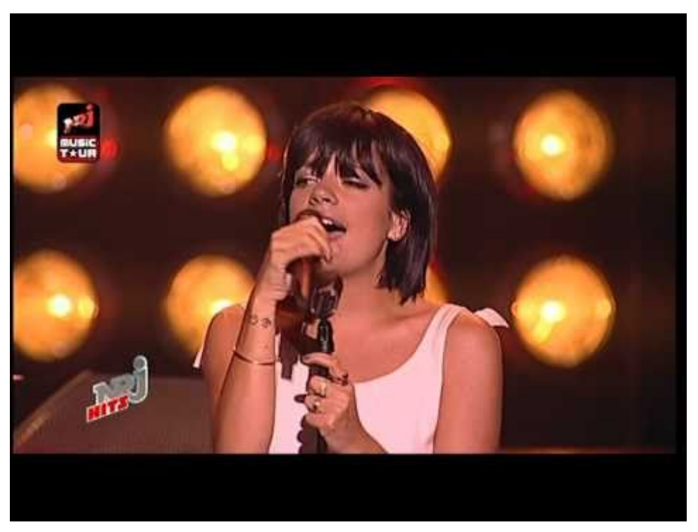
Watch Video At: https://youtu.be/2rGypxyL-ho

ReplyAgree/Disagree/Etc. This Commenter This Thread Hide Thread