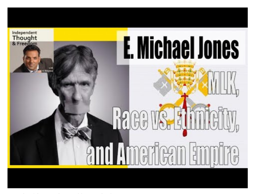
Watch Video At: https://youtu.be/O AICBsBeoM

There's another major angle to this whole topic and any discussion of it is verboten. It is how ADOS blacks were used—by you know who—as proxy warriors to break up ethnic neighborhoods. Black sharecroppers from the South were moved into jail-like residential housing complexes in places like Chicago or Philadelphia. Blacks were moved out rural areas into hellish urban housing complexes.