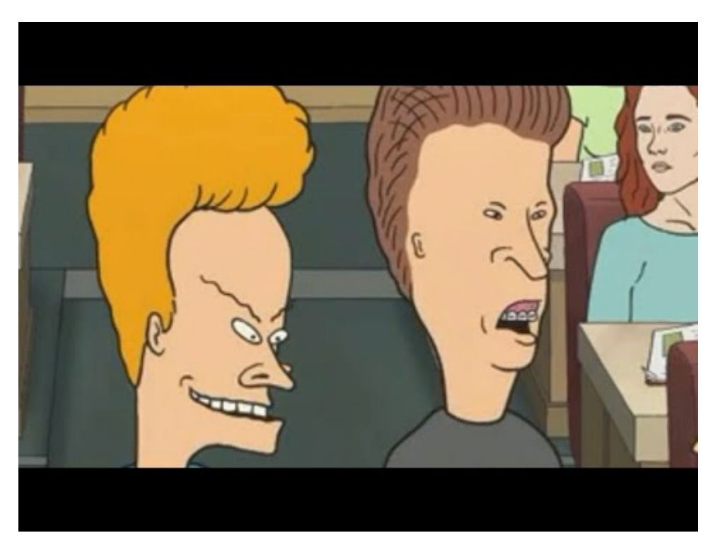
Watch Video At: https://youtu.be/N8mzQKl1LH8