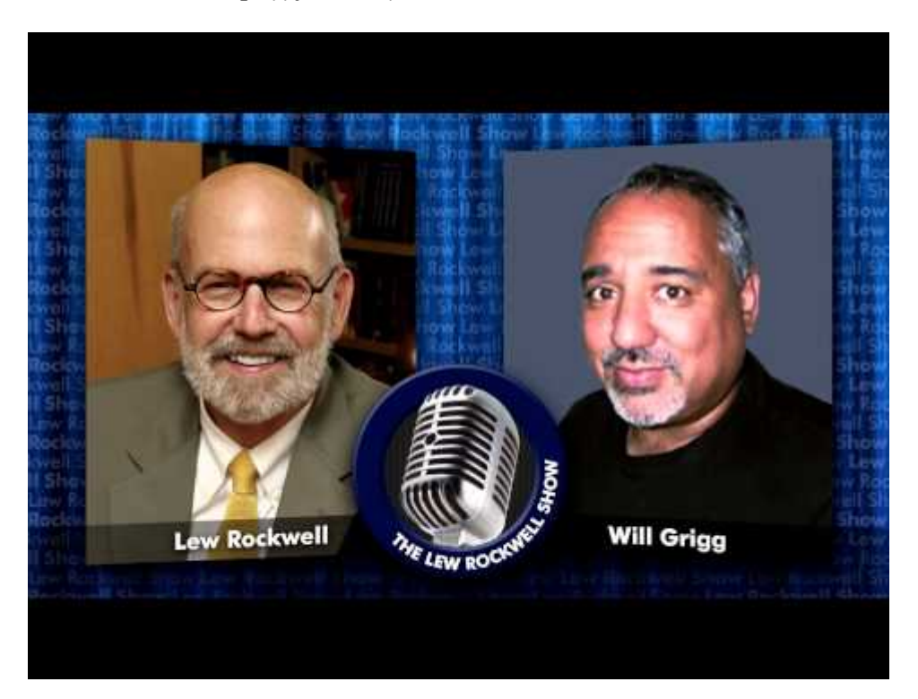
Watch Video At: https://youtu.be/FMoL-tfQ w