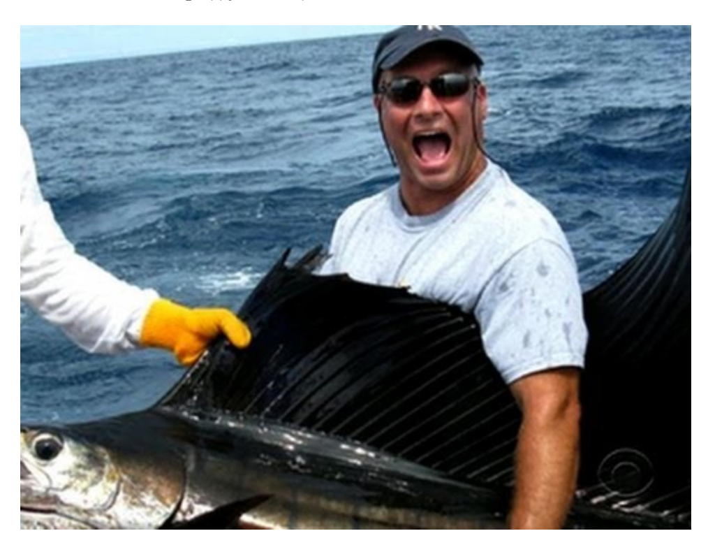
Watch Video At: https://youtu.be/IZQA8iMK2XQ