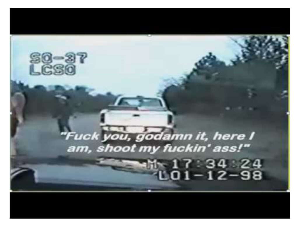
Watch Video At: https://youtu.be/mssNOhv1UMc