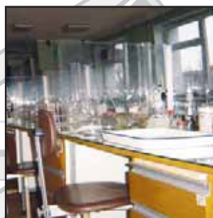
The Institute's training facility