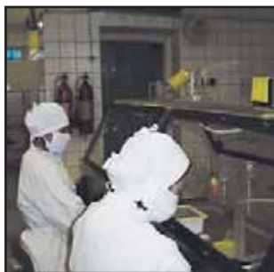
Working in the biosecurity unit