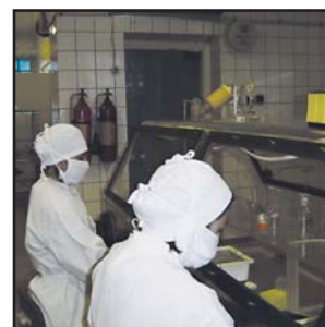
Working in the biosecurity unit