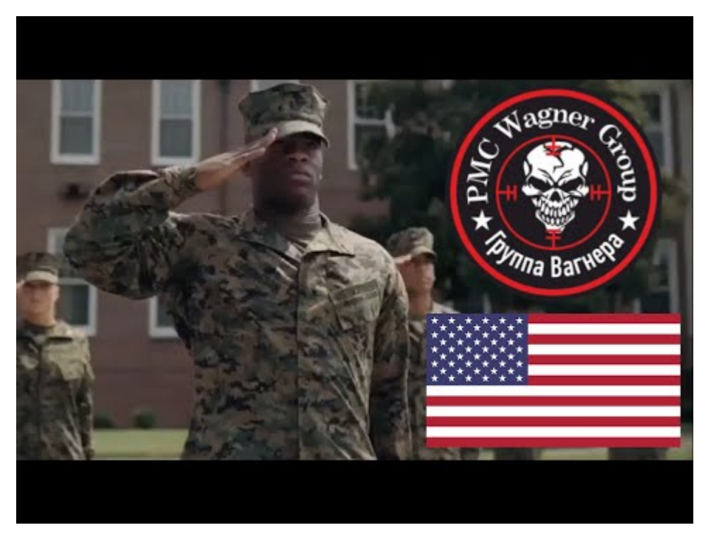
Watch Video At: https://youtu.be/63XCt8BobKY

ReplyAgree/Disagree/Etc. This Commenter This Thread Hide Thread