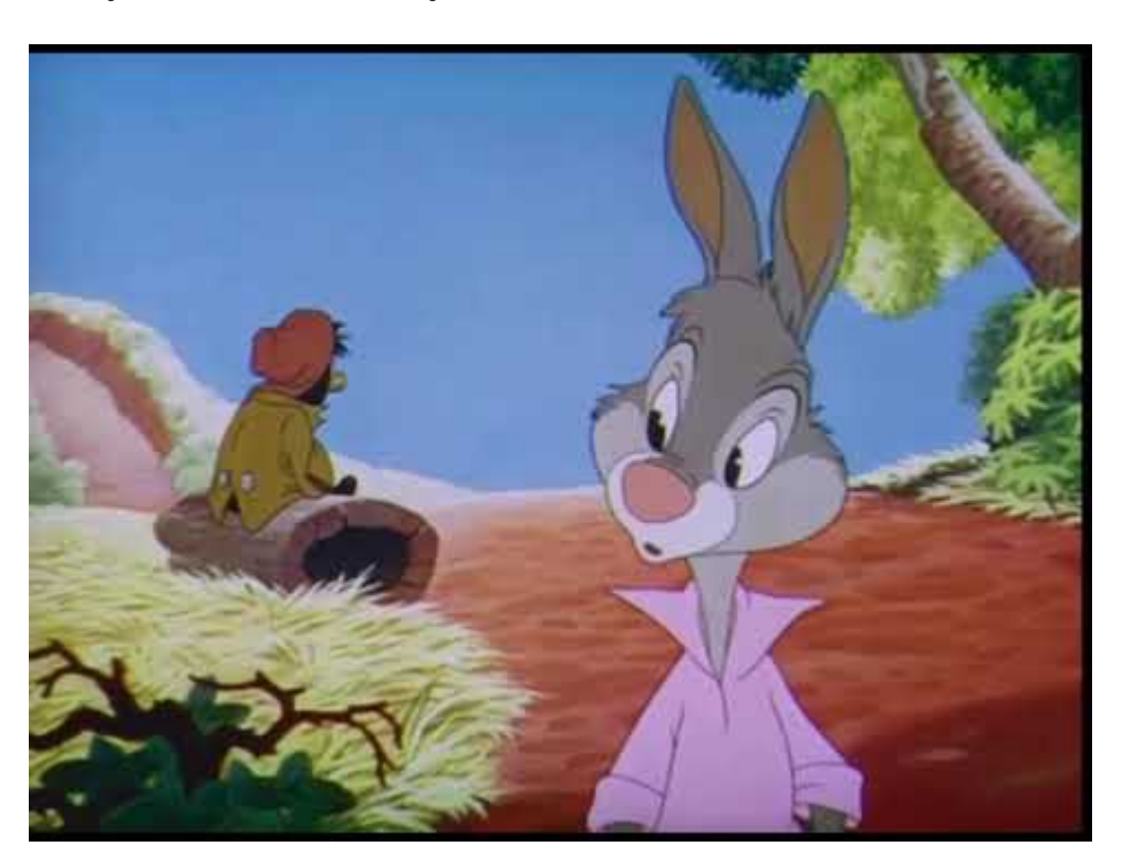
Watch Video At: https://youtu.be/qpGL-mj-LEk