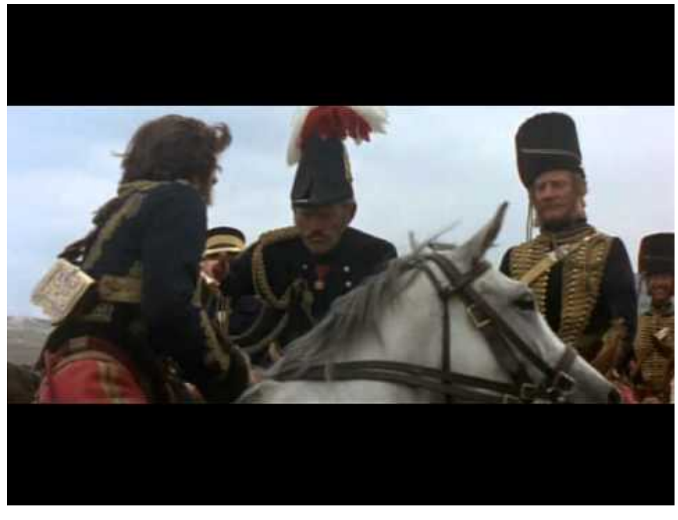
Watch Video At: https://youtu.be/h28yyg3pABM

Odpovědět Souhlasím/Nesouhlasím/atd. This Commenter This Thread Hide Thread