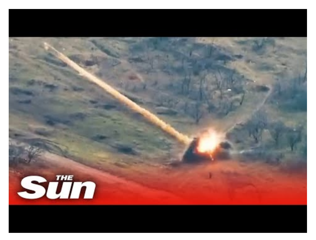
Watch Video At: https://youtu.be/XtDoPvaCbFQ

Do those look like soldiers to you? What is the military strategy in dropping men in the middle of nowhere and without armor support?