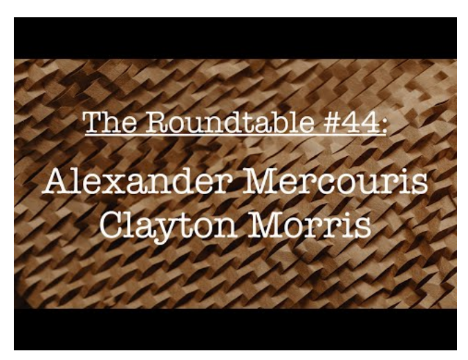
Watch Video At: https://youtu.be/xJs3SGKqk-o

January 22, 2023 at 10:05 pm GMT • 8.4 days ago ↑ @Realist