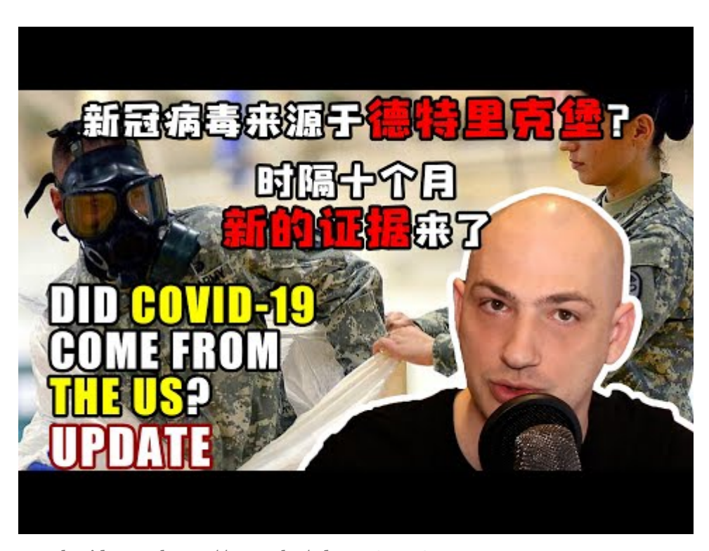
Watch Video At: https://youtu.be/cdKI5qOF a8

141. <u>Baron</u> says:Next New Comment <u>January 28, 2023 at 1:46 am GMT • 2.3 days ago</u> ↑ Nathan has an excellent contribution, all facts: