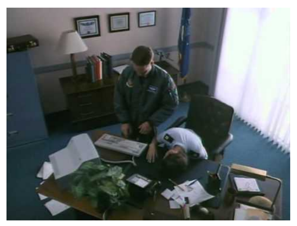
Watch Video At: https://youtu.be/zJ5tB7qtLGo

Because these things are kept securely, there are procedures to access them to ensure there is no mix up and they have labels.