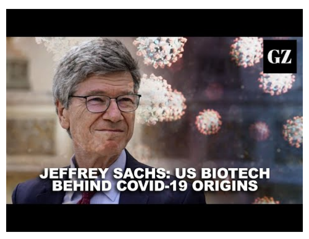
Watch Video At: https://youtu.be/morj-3rdWwM

Jeho říjnový podcastový rozhovor na Grayzone Maxe Blumenthala se nyní blíží 400 000 zhlédnutí, což je již druhé nejoblíbenější video, jaké kdy bylo na tomto kanálu uvedeno.