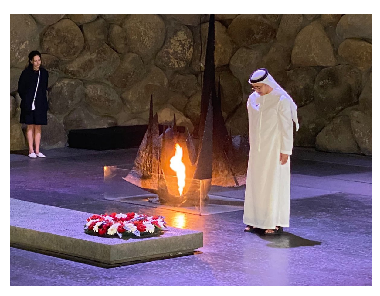
ReplyAgree/Disagree/Etc. This Commenter

Today, #WeRemember and honour the victims of the Holocaust on International #HolocaustRemebranceDay As a champion of religious freedom, tolerance & pluralism, #UAE Foreign Minister H.H. Sheikh Abdullah bin Zayed payed his respects to the Holocaust Museum in Jerusalem