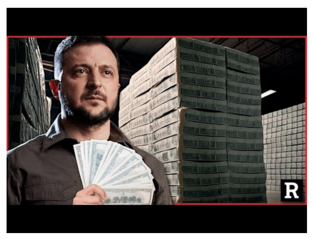
Watch Video At: https://youtu.be/PgoScJ7vXe4