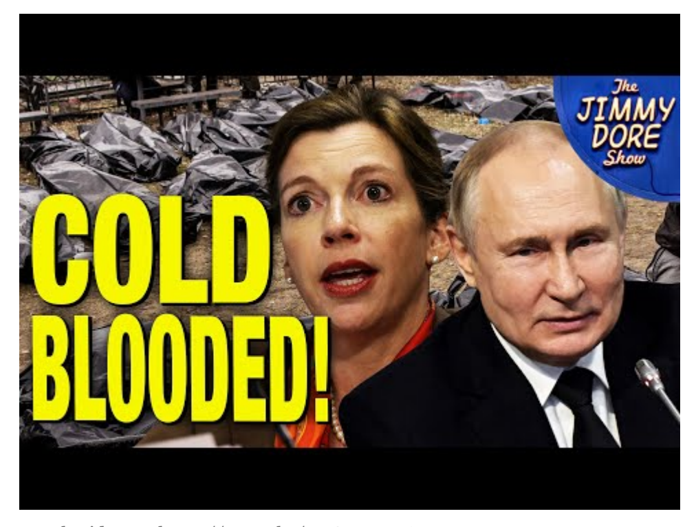
Watch Video At: https://youtu.be/Mg8e2cEpa64

But in support of the argument of the article, there's also the recent interview with the psychopathic Evelyn Farkas, who, being asked to predict political turmoil in 2023, conceded that none was forthcoming in Russia, ... unless there are 'many more body bags,' which, she seemed to imply, they're assiduously working to achieve, but did not seem to hold out much hope for.