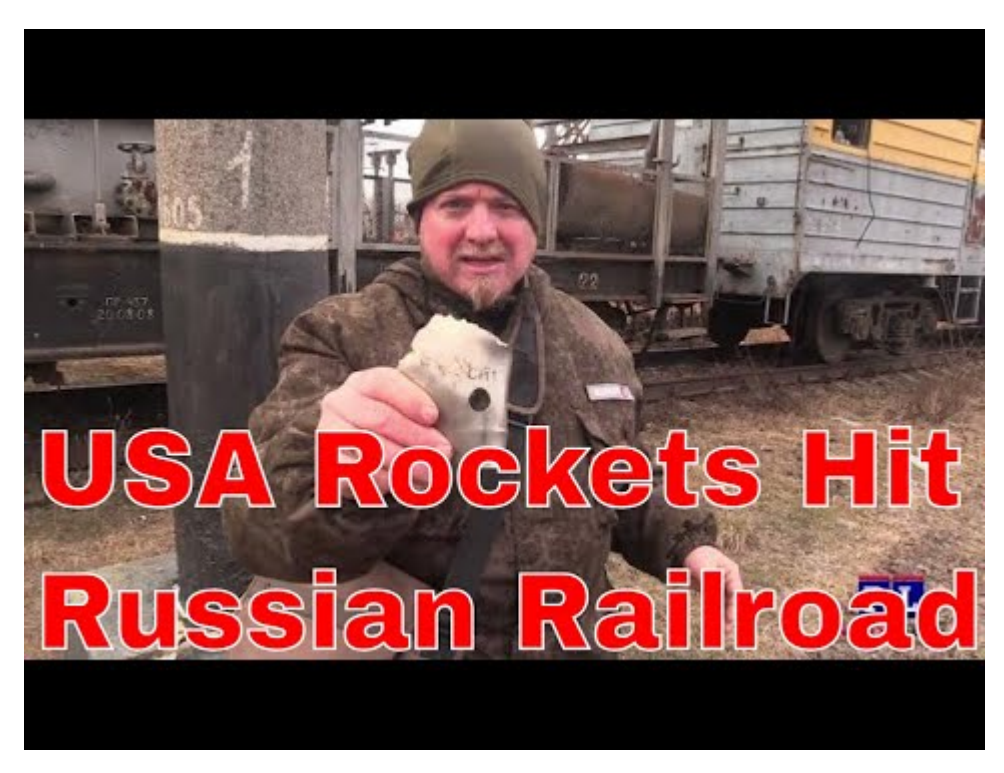
Watch Video At: https://youtu.be/zu2ZCQ6VQIY

set had a different target and armament. The first Set I saw had one surface explosion and one underground explosion directed to Damage the electric station of the railroad system.