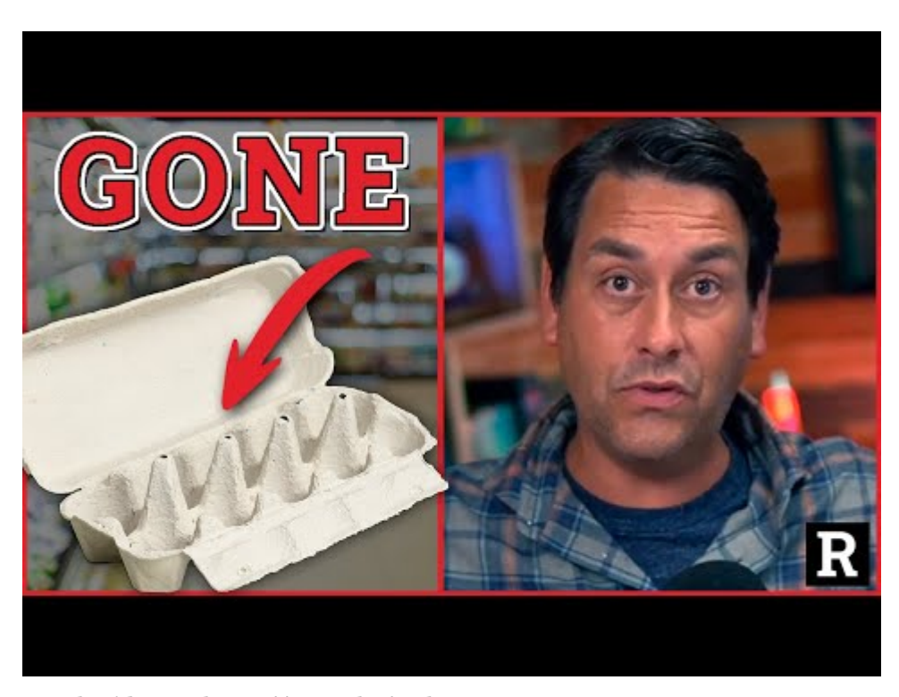
Watch Video At: https://youtu.be/yzrbmYv3zMo

(((WEF))). What's that got to do with the price of eggs?