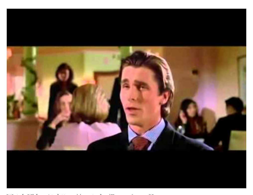
Watch Video At: https://youtu.be/Zu3nu6ue2qU

Někdo z reakční pravice to čte a říká si: "Kritizovat kapitalismus?! Ty Antifa pinko komunistický marxistický žid. Jen si chceš vzít moje peníze a dát je nějakému #BLM crack ho a jejím dětem. Do prdele s tebou a menorou, na které jsi jel." Klidný šerif. Abych citoval Patricka Batemana z American Psycho: "Zchlaďte to antisemitskými poznámkami." Předstírejte, že jste v jednom z těch 5hvězdičkových luxusních ášramů navštěvovaných bohatými bílými a Maharishi v čele třídy, kteří vám říkají, abyste šli ommmm. Dýchej dítě, dýchej.