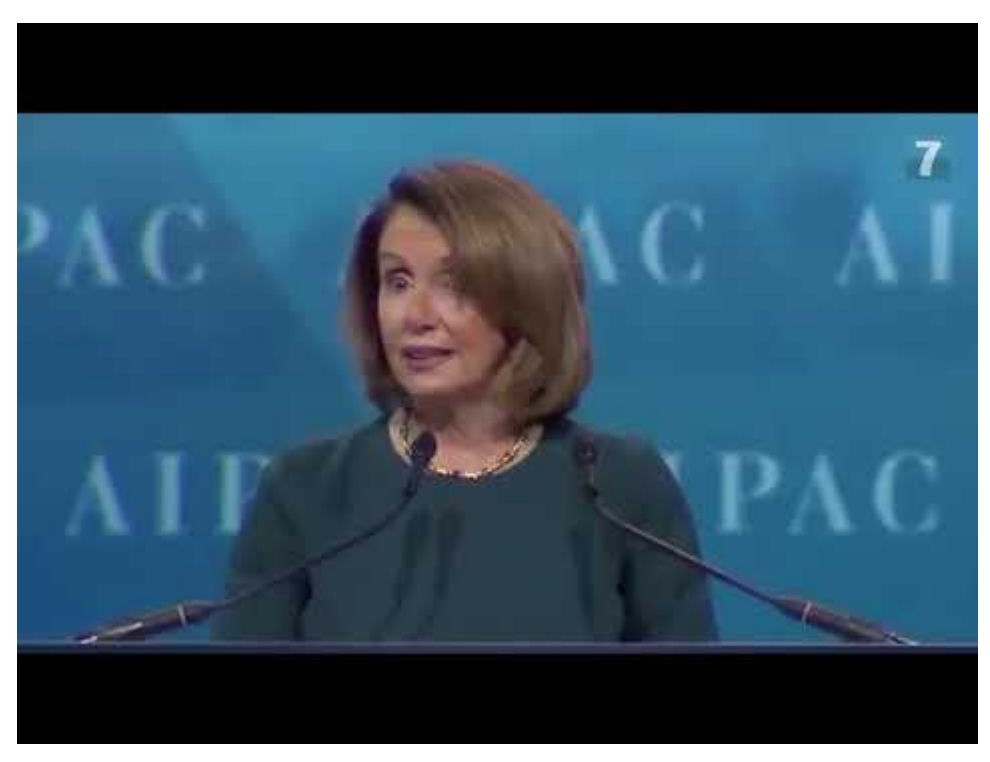
Watch Video At: https://youtu.be/FJofc7xRoog

January 25, 2023 at 11:26 am GMT • 7.9 hours ago ↑ Space aliens are pulling all the strings: