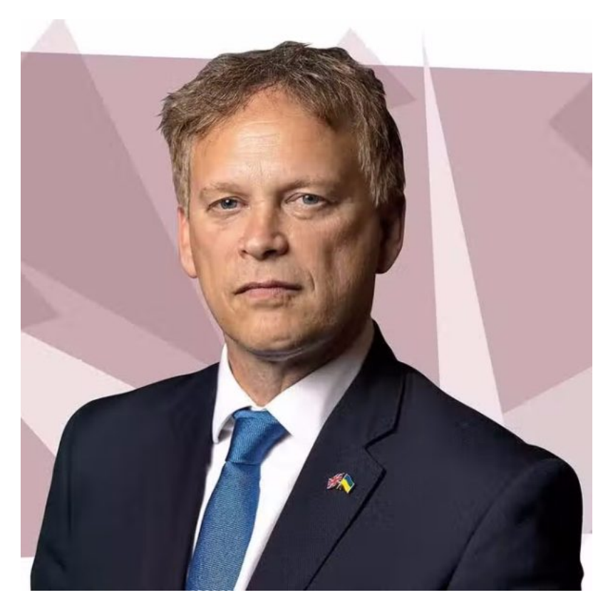
Pokřivený Žid Grant Shapps a jeho malý odznak na klopě

<u>Tobias Langdon</u> • 14. ledna 2023 • 2 000 slov • <u>146 Comments</u> • <u>17 New</u> • <u>Odpovědět</u> <u>Sdílejte s Gabem</u>