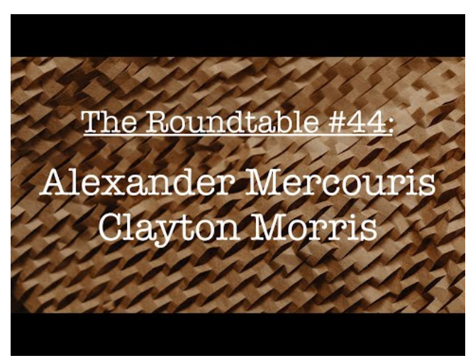
Watch Video At: https://youtu.be/xJs3SGKqk-o

January 22, 2023 at 10:05 pm GMT • 1.6 days ago ↑ @Realist