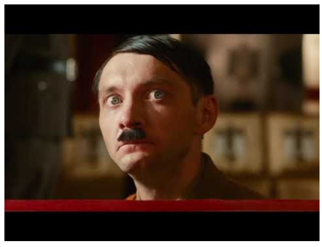
Watch Video At: https://youtu.be/YRJi k5jhKo