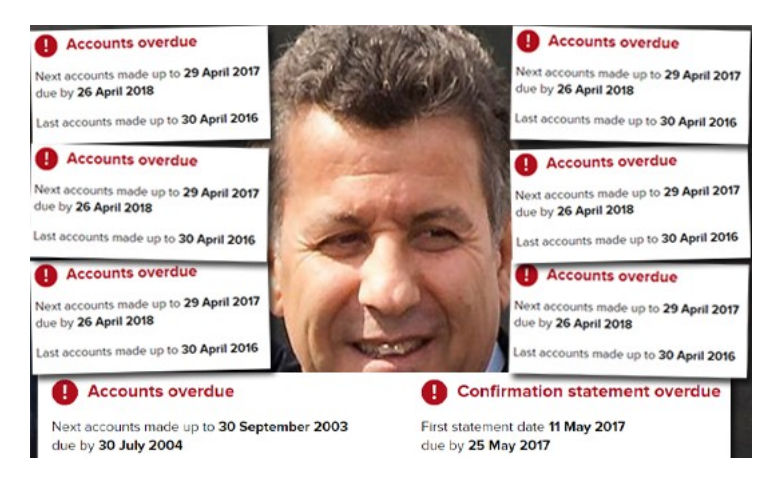
Pokřivený Žid Ehud Sheleg, penězokaz pro nekonzervativce

Ve skutečnosti ne, ani labouristé, ani konzervativci nejsou "proti imigraci". Oba tomu velmi fandí. A čím horší kvalitu migranti mají, tím víc se jim to líbí. Jak jsem již <u>dříve poznamenal</u> na Occidental Observer , kdybyste hledali svět a našli nejhorší možné země, ze kterých by bylo možné přijímat migranty, Pákistán by byl velmi blízko vrcholu seznamu. Má nebetyčně vysokou úroveň korupce a nejnižší úrovně civilizace. Mezi mála věcí, které v Pákistánu vzkvétají, jsou <u>sexuální zločiny</u> , <u>inbreeding</u> a <u>mimosoudní popravy</u>za údajné rouhání proti proroku Mohamedovi. Když Pákistánci migrují na Západ, přinášejí s sebou všechnu tu bohatou živost. Pákistánci v Británii spáchali <u>mnoho tisíc sexuálních zločinů</u> proti bílým dívkám a ženám, uvalili na bílé obrovské náklady <u>prostřednictvím krádeží</u> , sociálních podvodů a daňových úniků, uvalili další obrovské náklady na National Health Service s <u>hroznými genetickými chorobami</u> , které z toho vyplývají . z jejich příbuzenské plemenitby a zaútočili na svobodu projevu vyhrožováním nebo <u>skutečným spácháním vraždy</u> ve jménu Mohameda.