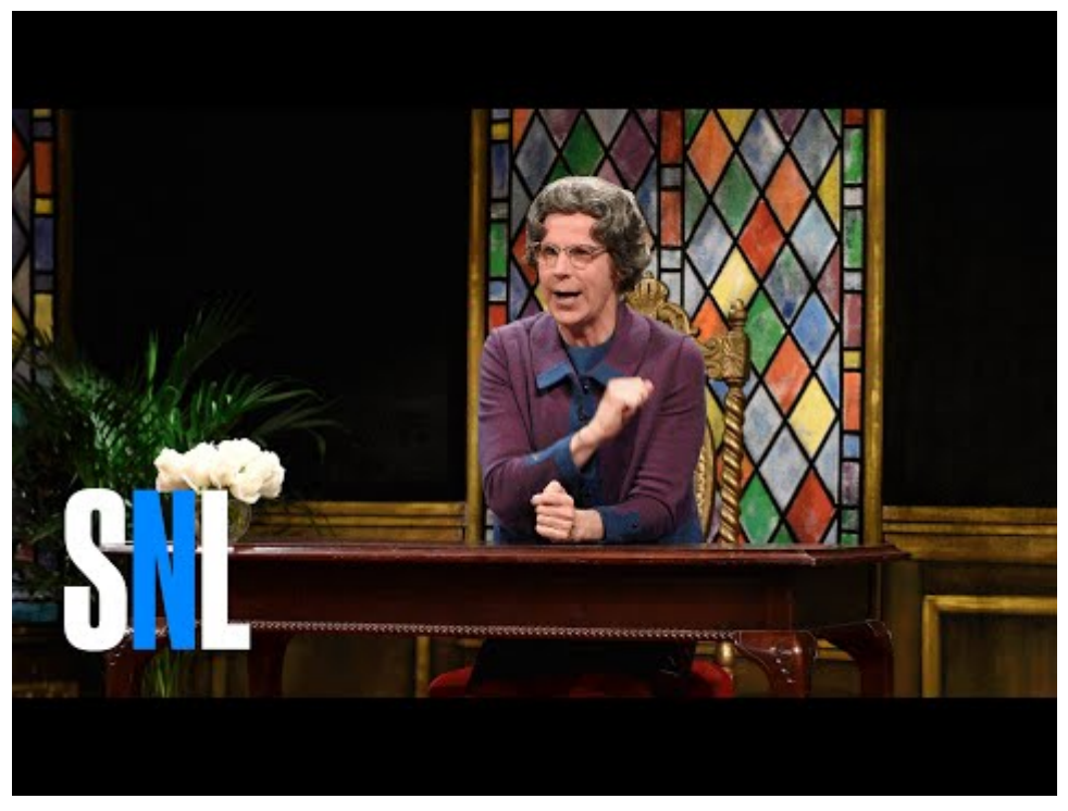
Watch Video At: https://youtu.be/YHyWoN5f7zQ

No TRUTH about the Ukraine War, The Great Reset/WEF, COVID and economic collapse/de-population agenda – that the Clot Shots are killing people, 9/11 – which the top Democrats were in on every bit as much as the Republicans – Schumer and Clinton Senators from NY on 9/11, the fact that the Financial system of the US and world is controlled by International Finance out of The City of London – are any of the Group of Thirty at Davos????, that the US Government seems to be controlled by Israeli/"Jewish" interests that are proxies for again the Satanic Beast monetary/corporate control systems.