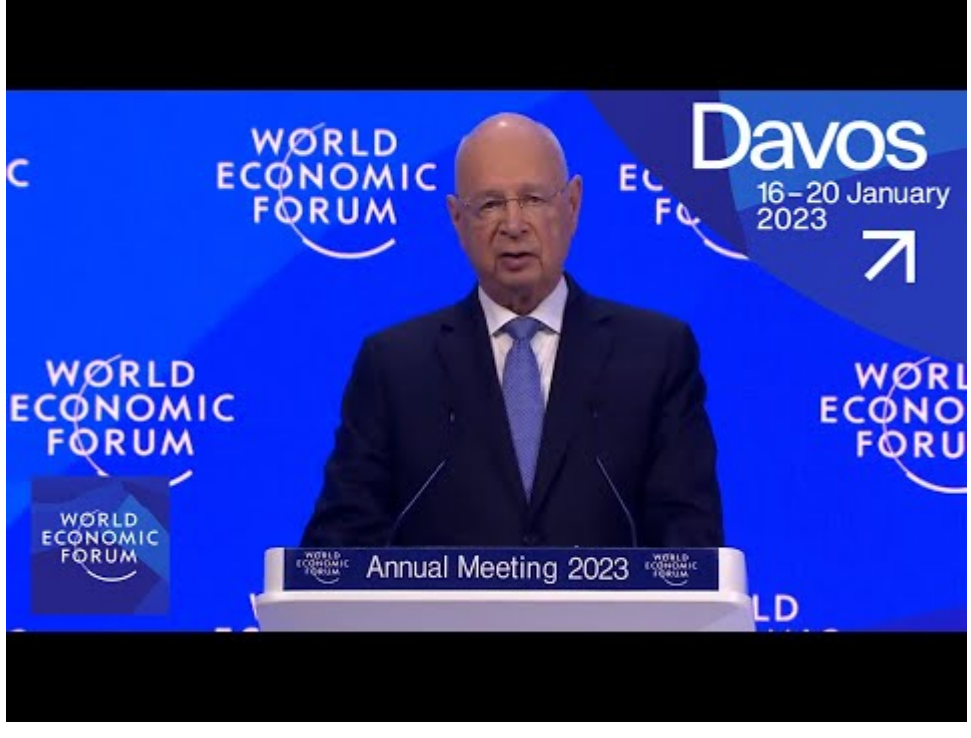
Watch Video At: https://youtu.be/vqjm35iZ9OA

Welcoming Remarks and Special Address from Klaus Schwab at Davos 2023. The World Economic Forum is the International Organization for Public-Private Cooperation. The Forum engages the foremost political, business, cultural and other leaders of society to shape global, regional and industry agendas. We believe that progress happens by bringing together people from all walks of life who have the drive and the influence to make positive change.