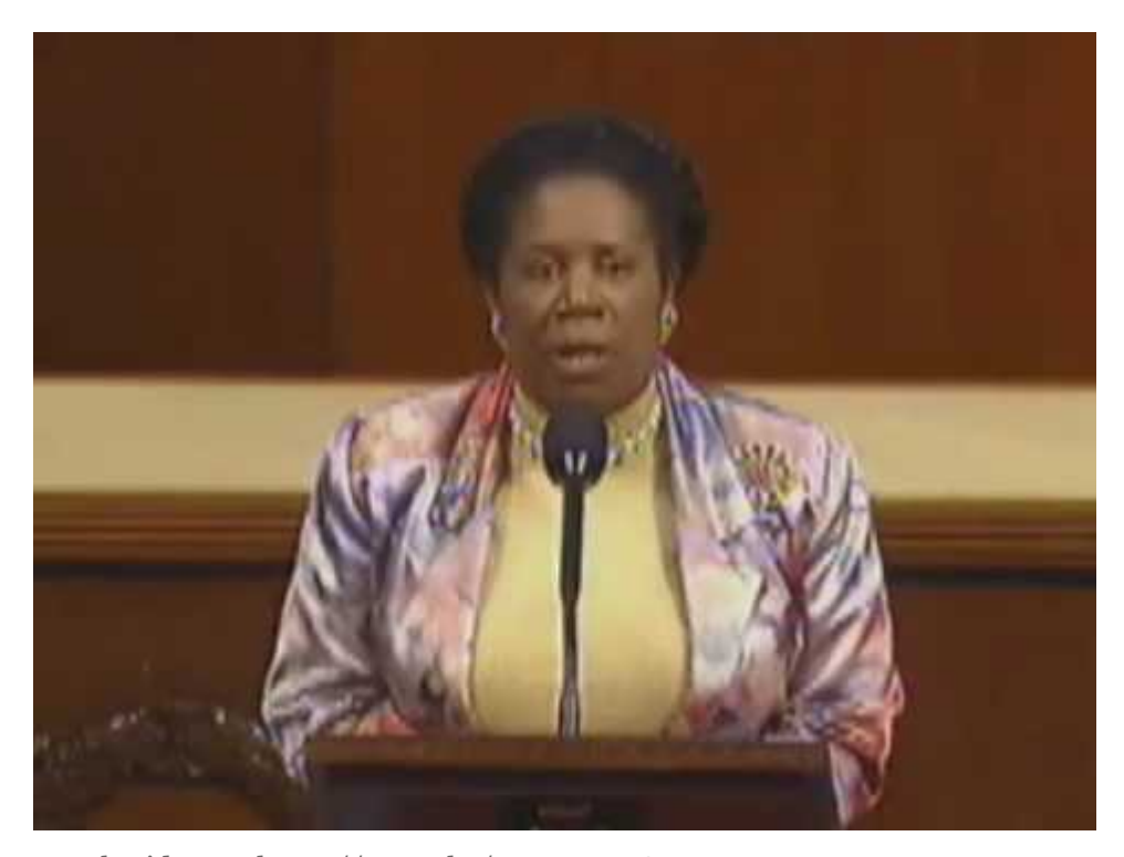
Watch Video At: https://youtu.be/XK3rTUgoQD4

I'm sure she would like to ban that video as well: