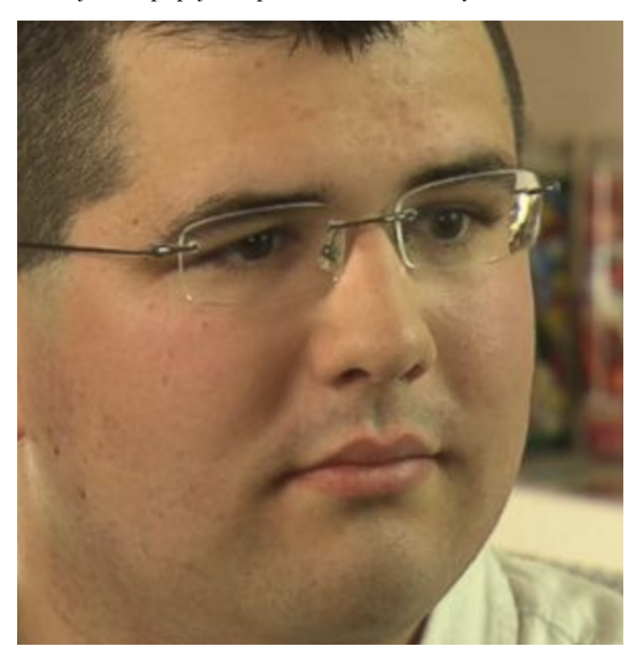
Už to neudělám, to vám můžu říct.