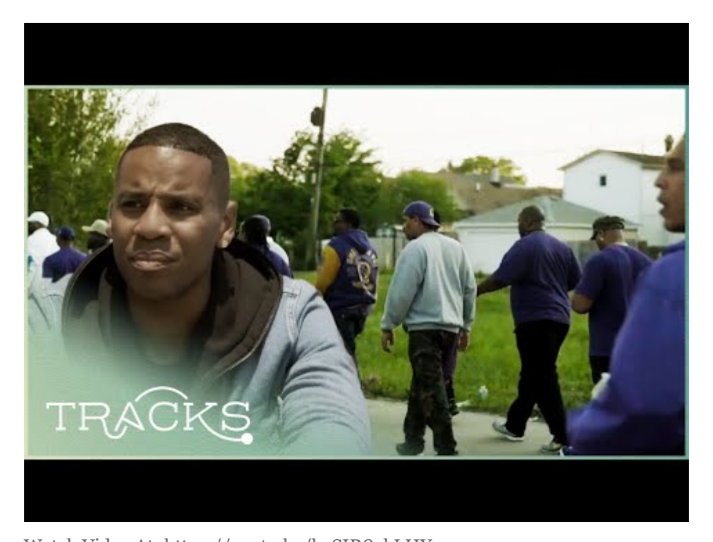
Watch Video At: https://youtu.be/baSIR8akLHY