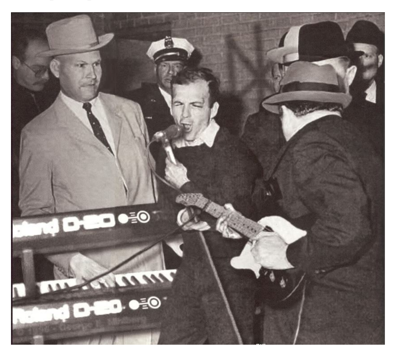
• Replies: <u>@Badger Down</u> ReplyAgree/Disagree/Etc. This Commenter This Thread Hide Thread

November 27, 2022 at 1:42 am GMT • 1.6 months ago ↑ Belarus foreign minister went to the Vatican for some secret talks about the war and instantly died suddenly. <a href="https://www.dailymail.co.uk/news/article-11472289/Belarus-foreign-minister-dies-suddenly-speculation-hed-discussing-secret-peace-plan.html">https://www.dailymail.co.uk/news/article-11472289/Belarus-foreign-minister-dies-suddenly-speculation-hed-discussing-secret-peace-plan.html</a>