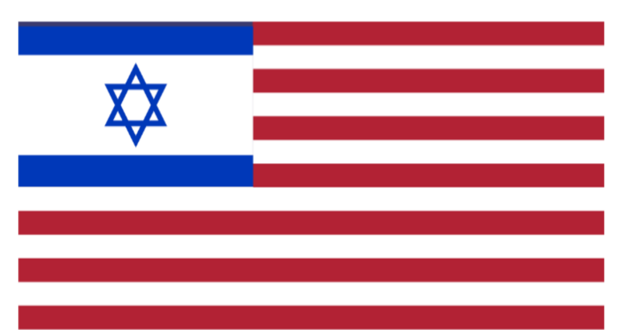
ReplyAgree/Disagree/Etc. This Commenter This Thread Hide Thread

If the new "Church" committee really does follow the evidence on government subversion of democracy wherever it leads that will be historical. If they trace the roots of the war on "domestic terrorism" back to the "global war on terror" they will find the masters of the Uniparty, America's most dangerous enemy. War Profiteers and the Roots of the 'War on Terror' <u>https://warprofiteerstory.blogspot.com/p/war-profiteers-androots-of-war-on.html</u>