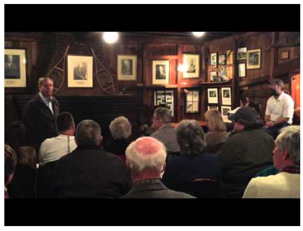
Watch Video At: https://youtu.be/MRrG4dbYmGk