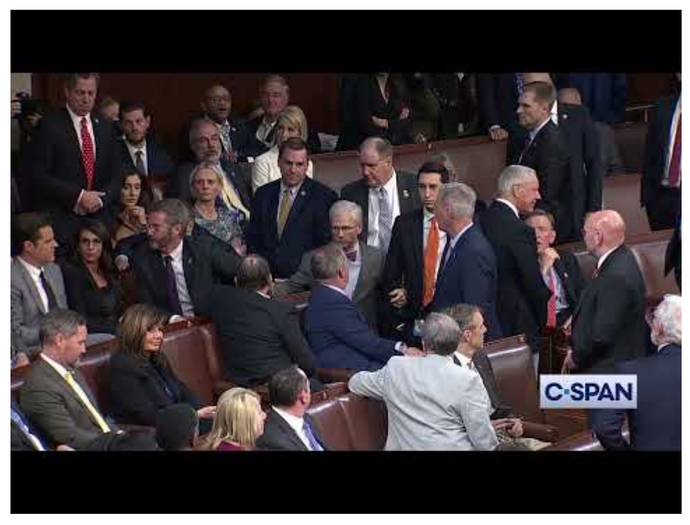
Watch Video At: https://youtu.be/Dp9XYnoEAMA

The picture in the tweet is a bit more dramatic than the video (\sim 1:20) .