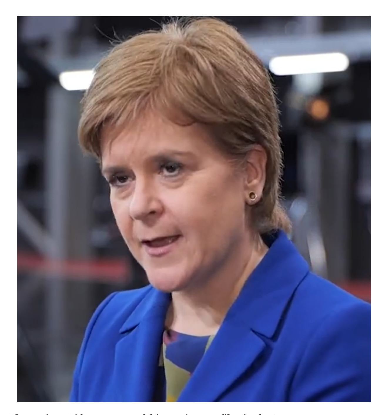
Glowering Giftzwerg: problémový transfil Nicola Sturgeon