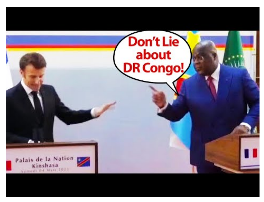
Watch Video At: https://youtu.be/CG8DRuzjXtQ

China is the last realm of honor and righteousness. The white man got the world on a platter and look at how he destroyed himself and the world with it. Christian morality, goodwill charity, lack of pride and faith despite blinding evidence of their superiority!!!!No sir, they deserve to go extinct.