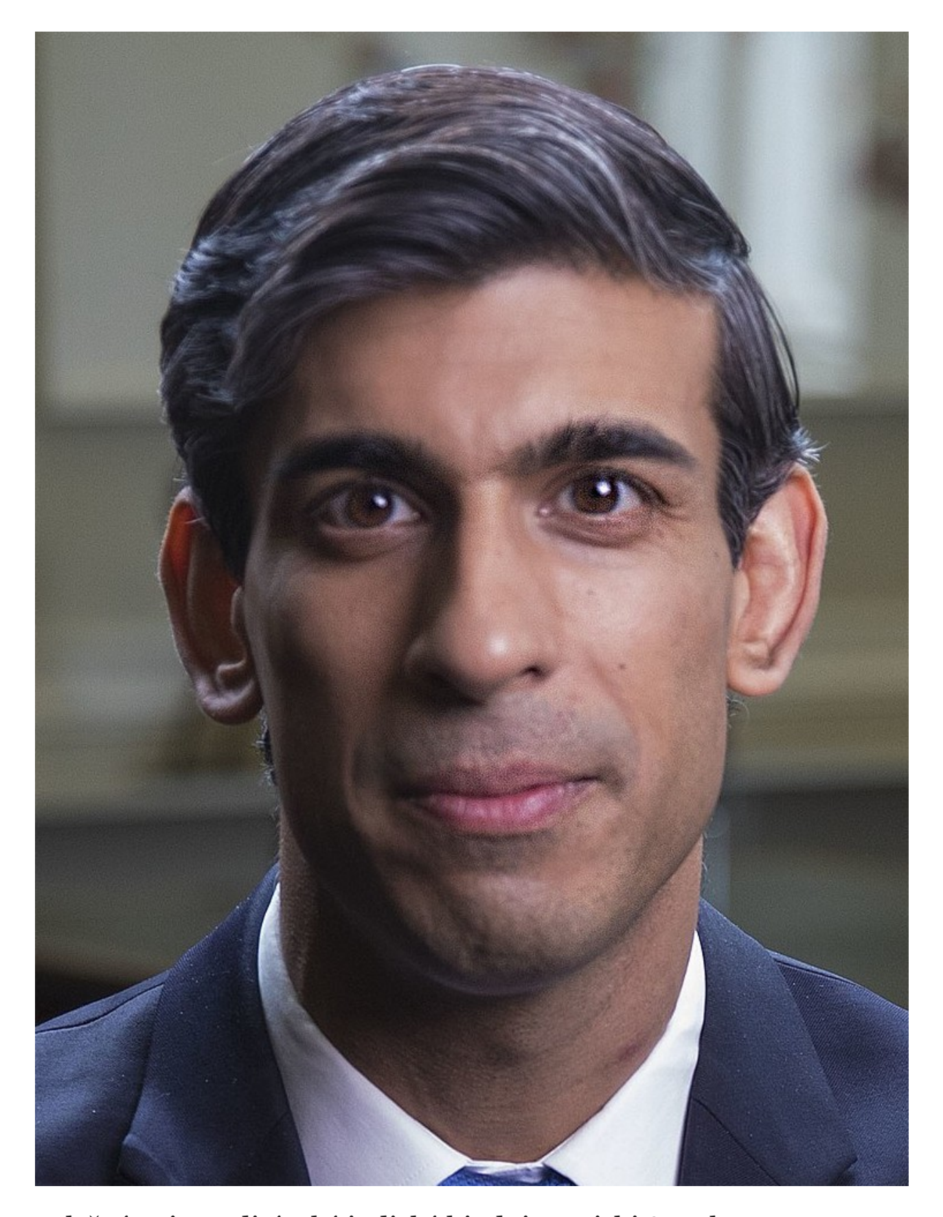
Falešný Brit: podivínský indický hinduista Rishi Sunak, transzápadní premiér Británie