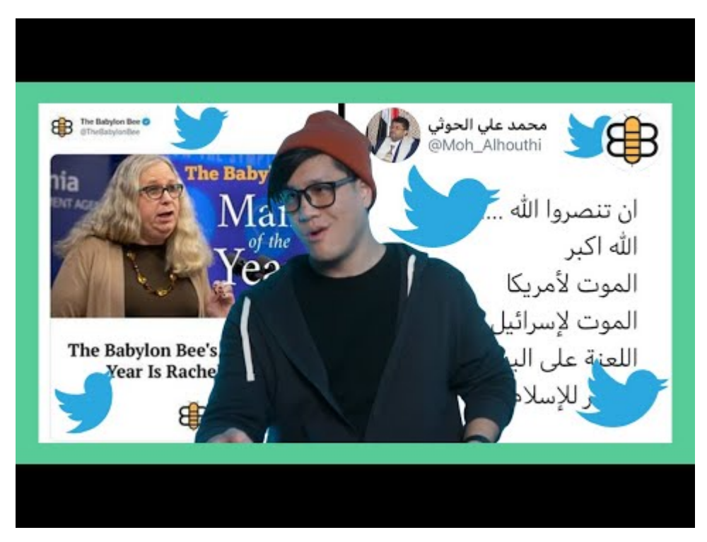
Watch Video At: https://youtu.be/aogo7vJDFao