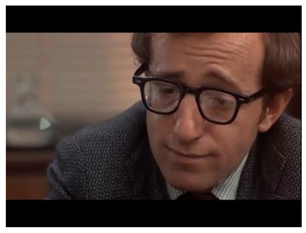
Watch Video At: https://youtu.be/-H3KaLZsbvo

My favorite scene from the movie "The Front"