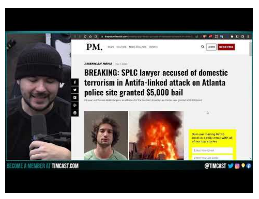
Watch Video At: https://youtu.be/8NNOD6lEH6o

Antifa. SPLC. Spoiled Rotten. Marxist/Communist Trust-Fund Children.