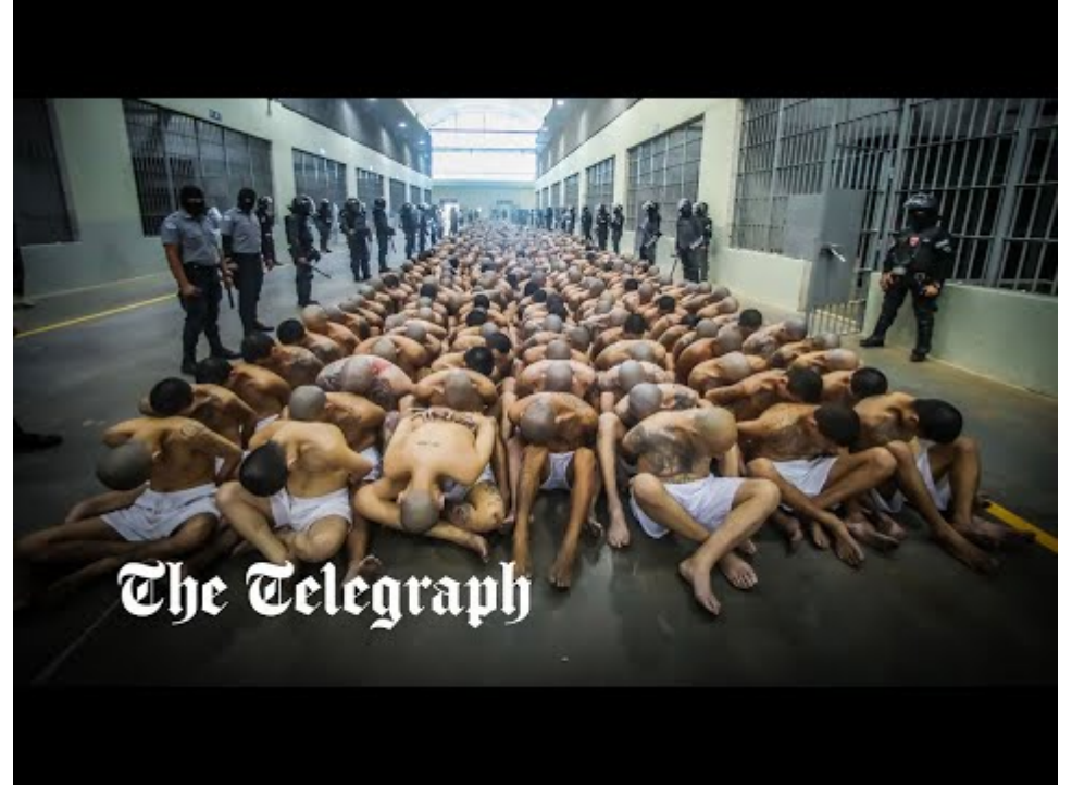
Watch Video At: https://youtu.be/zbmbzH4nVxw

Tato věznice byla oficiálně otevřena na konci ledna. Tento týden vláda přesouvá odsouzené dovnitř. Proto je El Salvador ve zprávách. Viděli jsme několik úžasných videoklipů, ve kterých byly stovky mužů, kteří měli na sobě jen boxerky, s vyholenou hlavou, ruce spoutané za zády, nahnáni v řadách a souborech přes uzavřené prostory do autobusů a odjeli do nového mega- vězení.