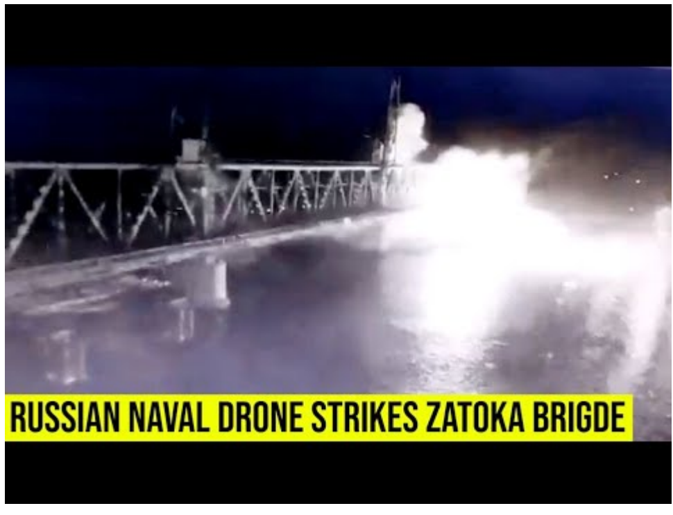
Watch Video At: https://youtu.be/hBV7IiVFsnI