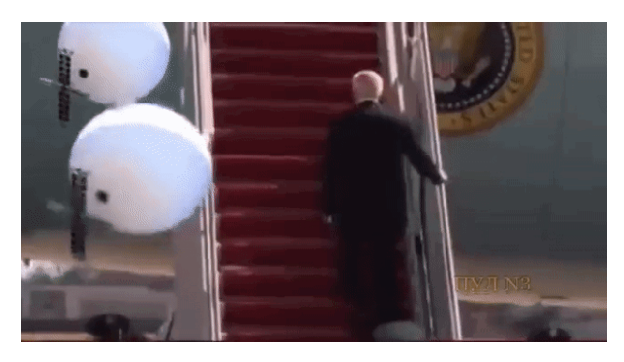
ReplyAgree/Disagree/Etc. This Commenter