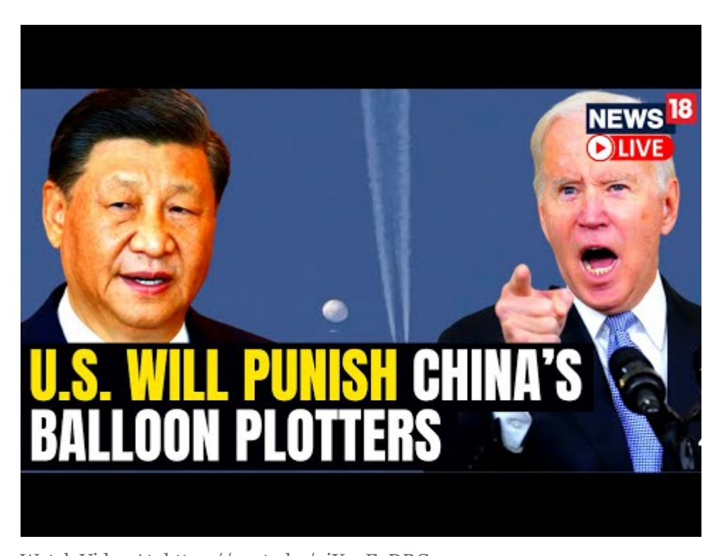
Watch Video At: https://youtu.be/pjXy3FpDRGs

sitting ducks for some garbled narrative pushing war with the Chinese to force gay marriage on them because of weather balloons. If the US wins a war with China, the whole world will be controlled by Jews, and this tranny stuff will come for all our kids. You'd think these fat retards would have some self-protection mechanism, but they just simply do not.