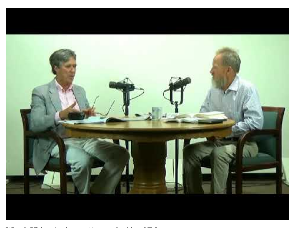
Watch Video At: https://youtu.be/d7zsNMmce2c

*Nb: Protestantism was founded as a revolutionary movement to subvert the Catholic Church (see EMJ's The Jewish Revolutionary Spirit for a detailed discussion of this). And especially obscene is how this revolutionary movement used the Catholic Church's book, the Bible, as part of this subversion (albeit, a redacted and re-translated version).