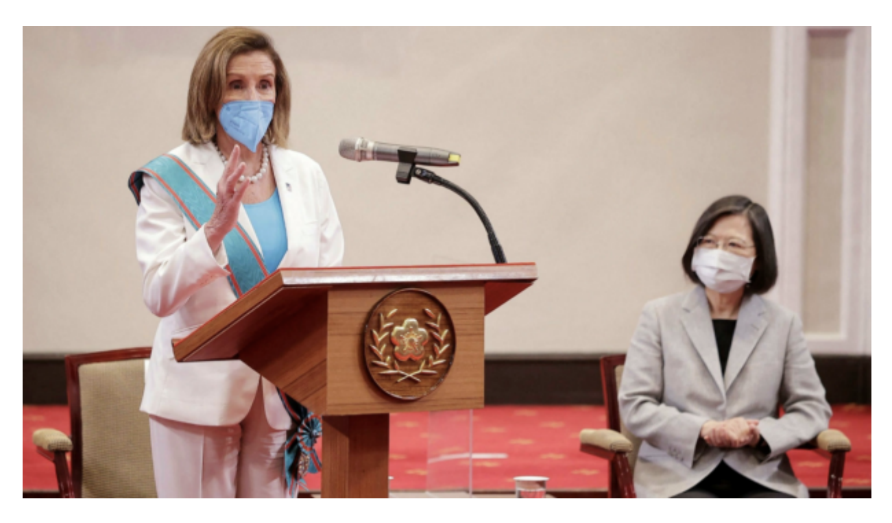
It just simply does not make sense.

Just reduce it to any single point: is Nancy Pelosi good? Is she bucking Joe Biden?