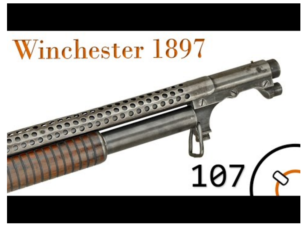
Watch Video At: https://youtu.be/oROttbSkayU