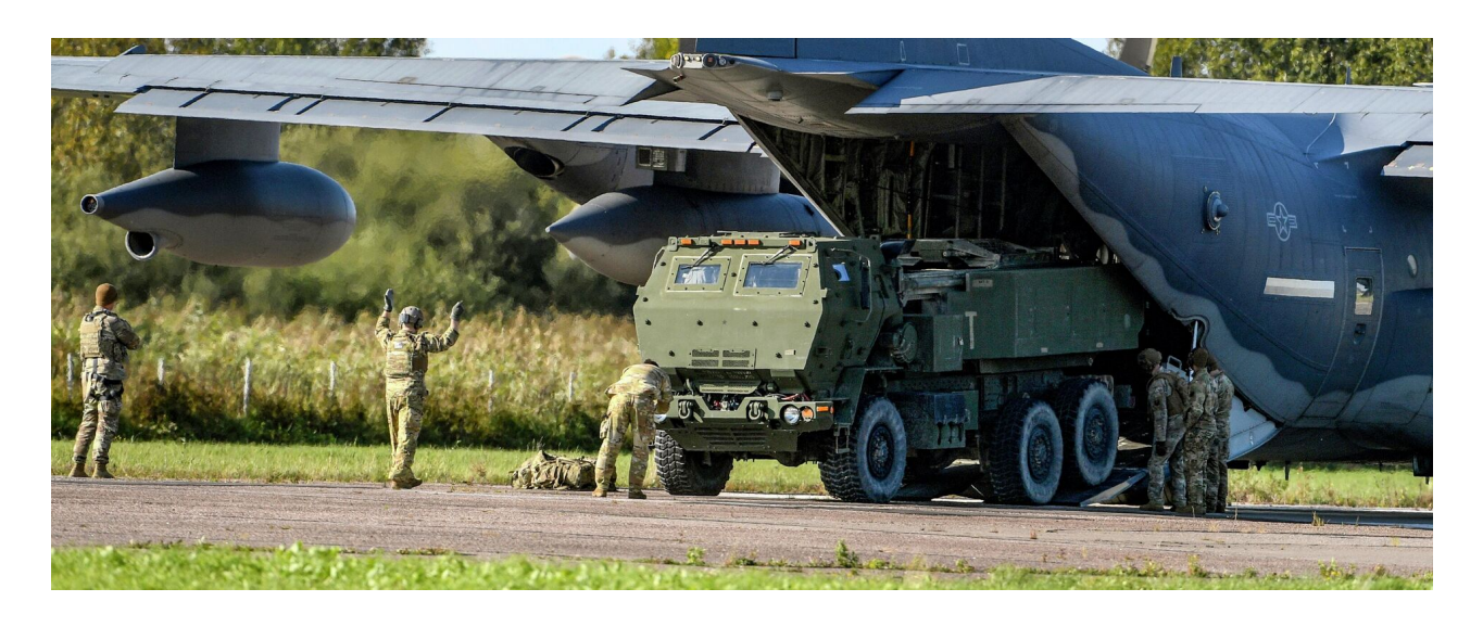
Russia's Special Operation in Ukraine New $2Bln Ukraine Aid Package Includes HIMARS Ammo, Switchblade Drones, Pentagon Says 19 hours ago

Biden's statement comes following multiple requests by the Kiev regime to be supplied F-16 fighter jets in order to bolster its military strength against Russia. Biden has <u>previously</u> noted that it would not be providing the fourth-generation supersonic fighter.