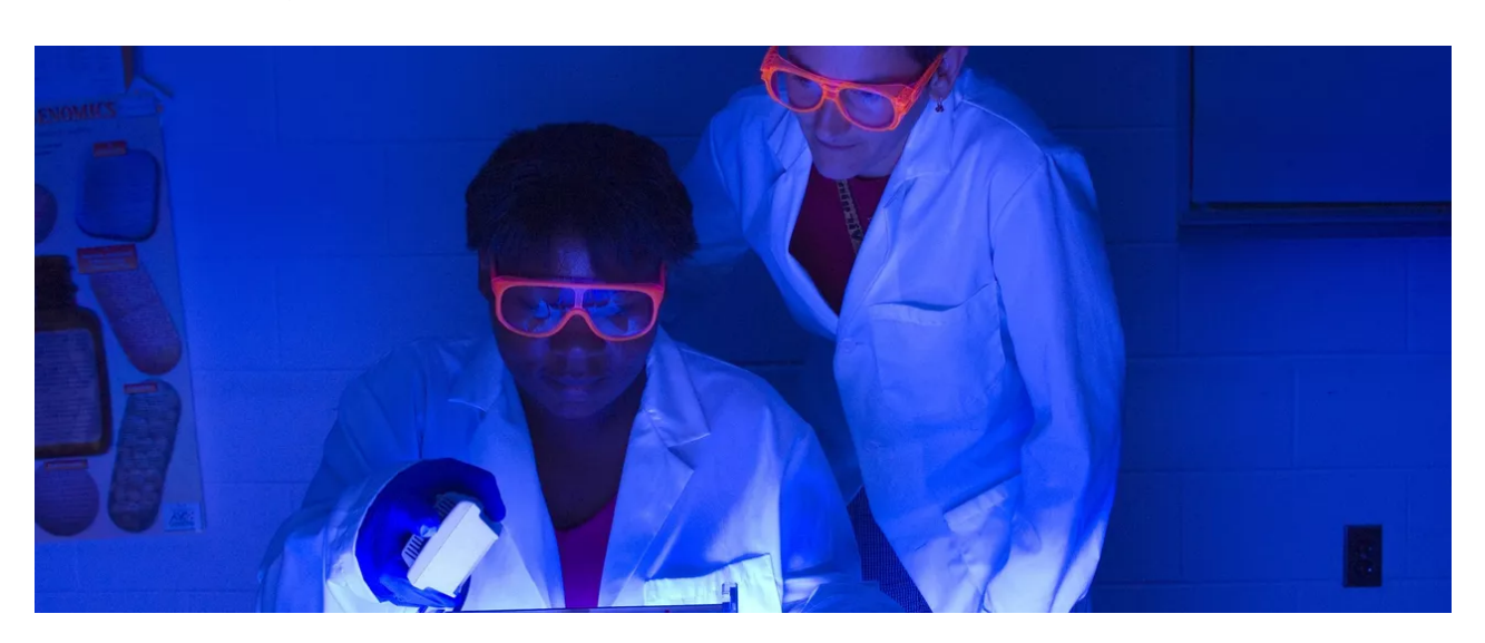
12. července 2021, 21:37

Vědec v současné době plánuje zaregistrovat neziskovou výzkumnou organizaci s názvem Pekingský institut pro výzkum vzácných onemocnění, uvedl list.