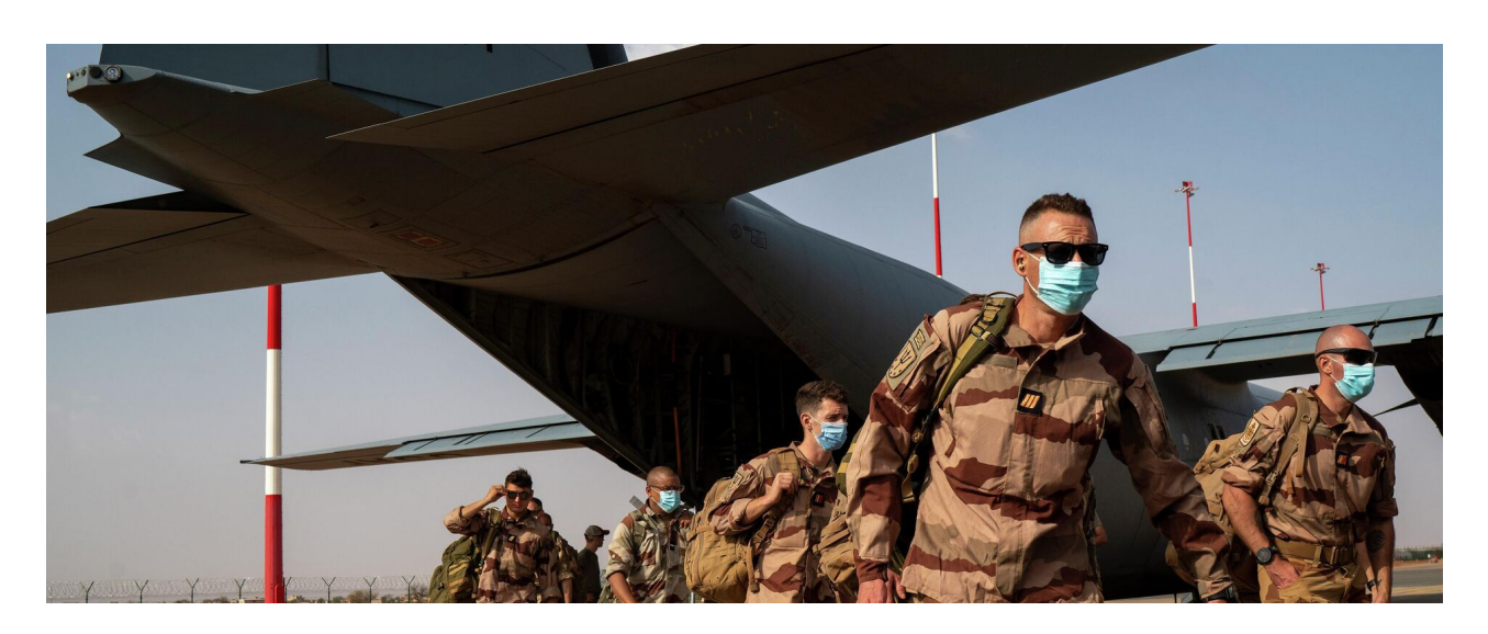
28 October 2022, 10:08 GMT

"Benkos Bihó became a leader who made it possible to transform the imaginary around the process of colonization and enslavement, showing that it was possible to escape this practice, this institution, and also that new conditions should be generated to inhabit these new territories, these territories built as palenques," Valderrama noted.