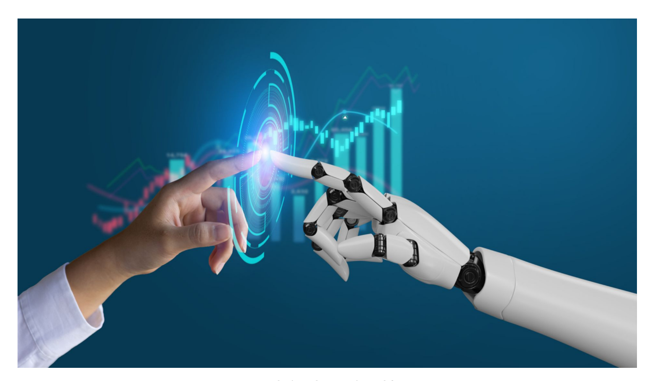
Ask it about itself.

Another one that we'll let you explore for yourself. The answers might surprise you, or not.