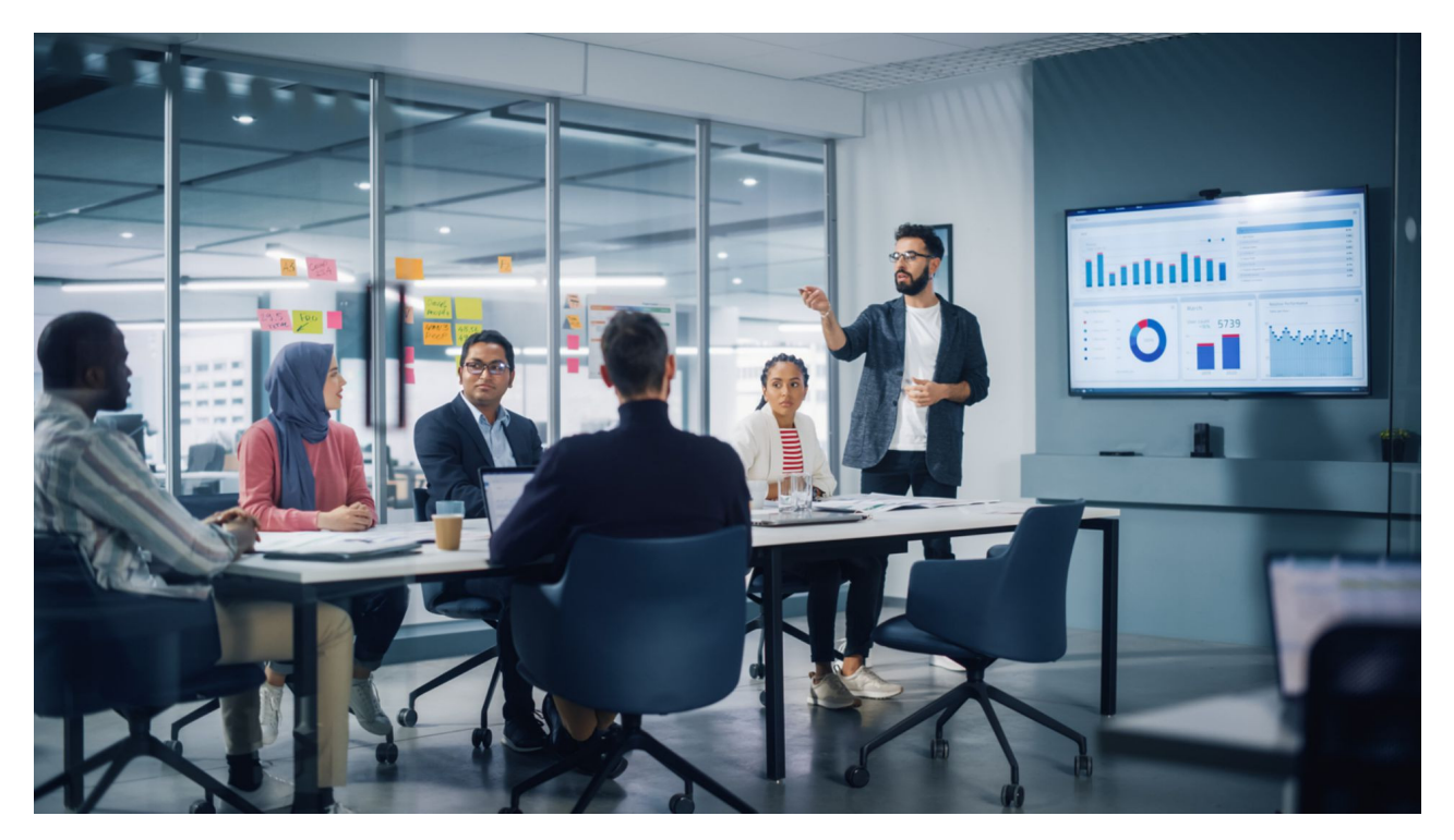
Let it help you prepare for that presentation.

Another option is to let ChatGPT generate some fast-hitting facts about a particular subject you may have a presentation on in the future. This could be for work, for a school project, or, indeed, for that all-important investor meeting.