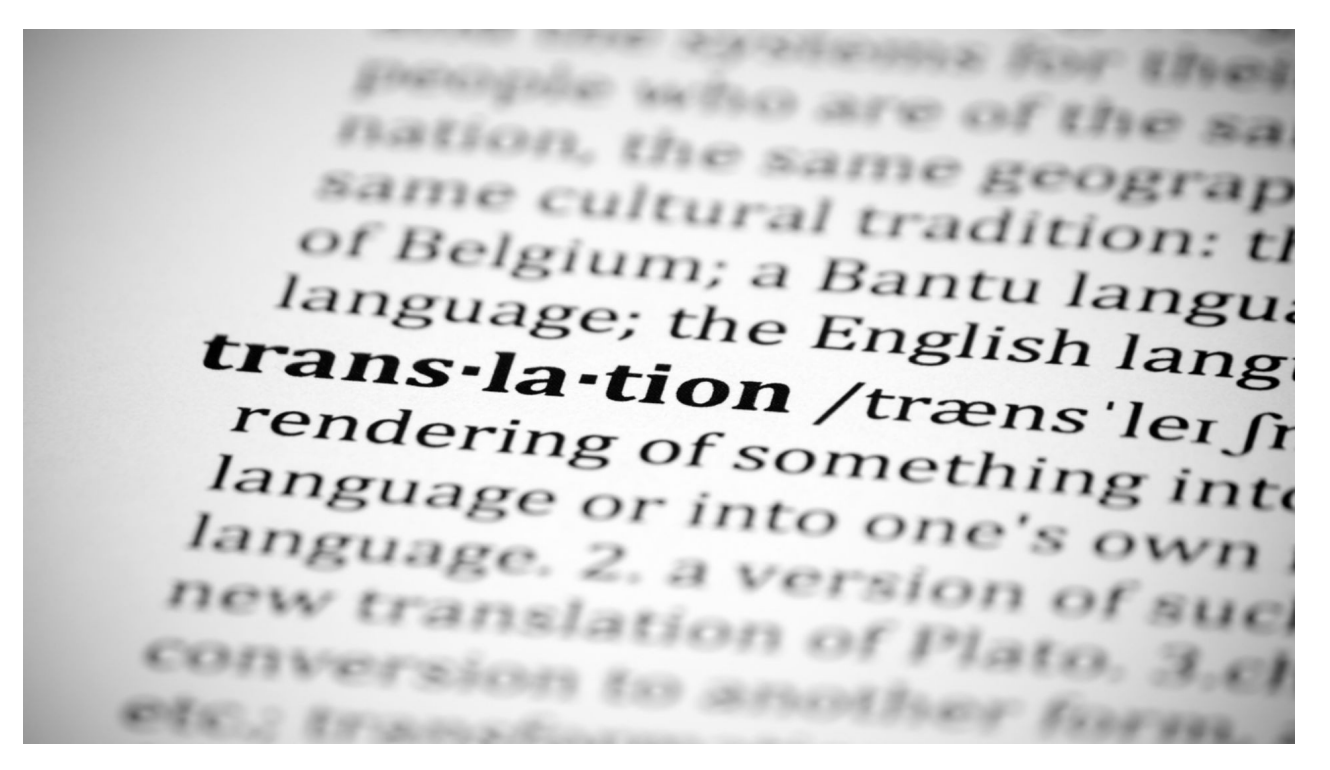
Ask ChatGPT to translate for you.

For content producers or companies with a traditionally global presence, nothing beats being able to speak to your customers in their native tongue. While traditionally, you'd need to employ the services of a translator; you might want to let ChatGPT have a go for you too.