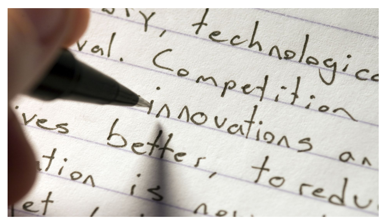
Let it help you write stuff.

Another fantastic ability of ChatGPT is its ability to provide you with a brief outline of a complex subject in seconds. This gives you the "in a nutshell" answer you are after and saves you hours of potential research scanning articles on the subject.