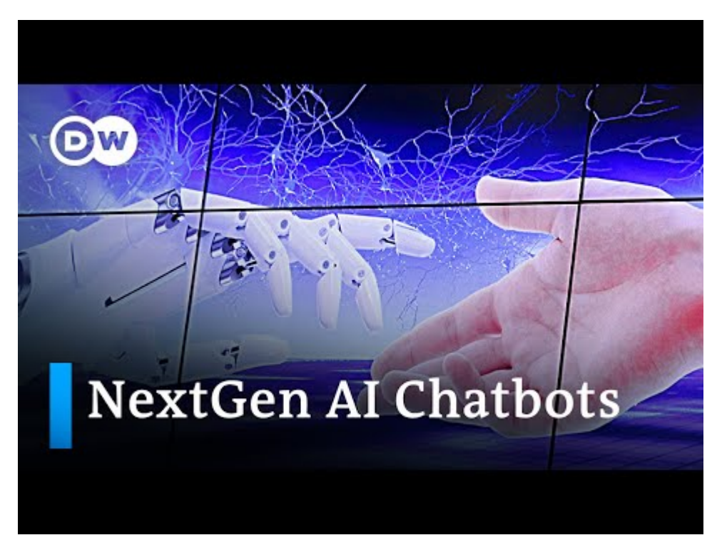
Watch Video At: https://youtu.be/fdY3otScGq8