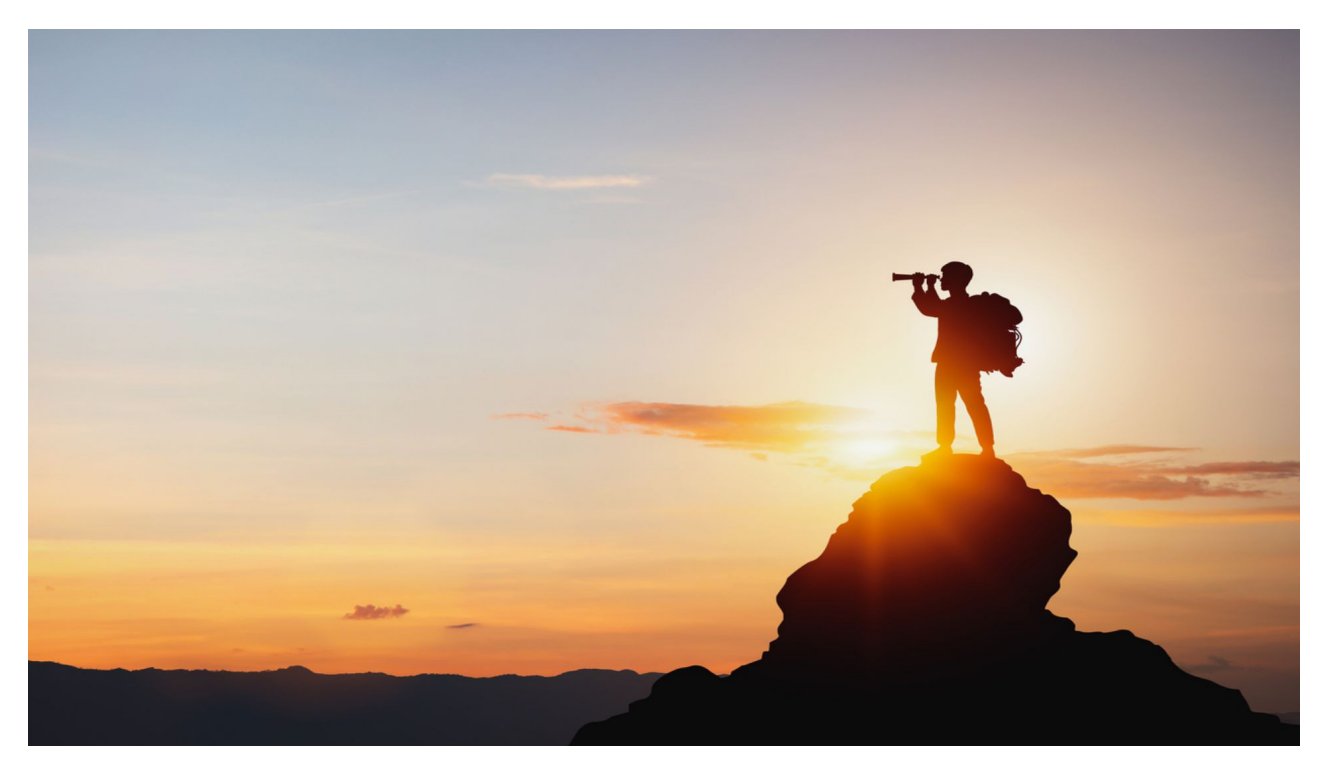
Have it take you on a journey.

As <u>discovered by Medium.com</u>, you can have ChatGPT take you on a little interdimensional journey.