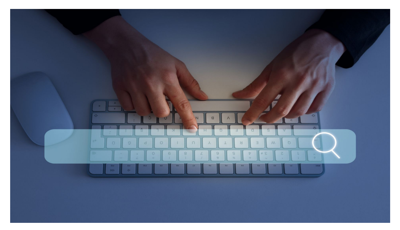
Basically, use it like a quick search engine answer finder.

Lastly, much to Google's horror, you can use ChatGPT like a convenient little internet search engine. While the results are only as up-to-date as late 2021, they can provide you with an answer rather than a set of recommended websites to consume to get an answer.