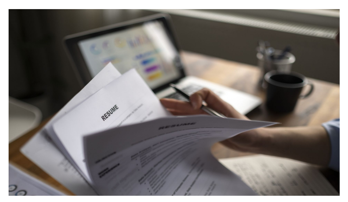
Have it write your CV.

This is possibly one of the most useful functions of the AI chatbot. With ChatGPT, you can write a customized CV and cover letter for each job you apply for.