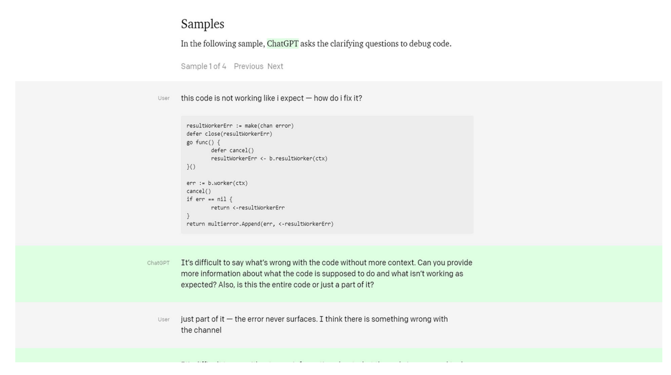
Some example interactions with ChatGPT.

The answer is, in short, they will eventually monetize it. For now, <u>as</u> <u>PC Guide</u> explains, they're probably leveraging our interactions with the AI to enhance the experience and collect more information about how people communicate to hone the model better. Though it is unlikely to be free indefinitely, and OpenAI has introduced premium programs.