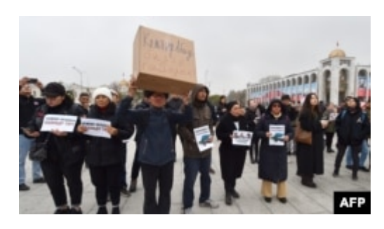
Demonstrators protest against a controversial border demarcation deal with Uzbekistan that critics say could see Bishkek hand over control of the key Kempir-Abad water reservoir.

Twenty-six Kyrgyz rights activists, opposition politicians, and journalists, who were arrested in October 2022 for challenging a controversial border deal with Uzbekistan, have been additionally charged with attempts to seize power and public calls to seize power, lawyers of some of them told RFE/RL on April 26. The charges could lead to prison terms of up to 15 years. The 26 men and women were initially accused of planning riots over a Kyrgyz-Uzbek border agreement that handed a disputed water reservoir over to Uzbekistan. Several of them were transferred to house arrest in early April. To read the original story by RFE/RL's Kyrgyz Service, click here.