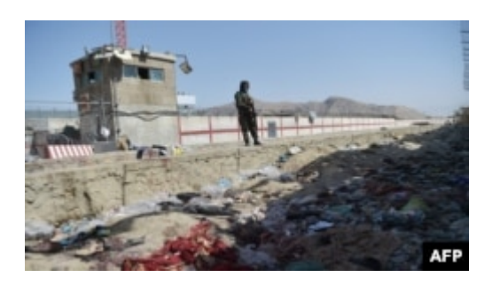
A Taliban fighter stands guard at the site of the August 26 twin suicide bombings that killed scores of people at Kabul airport in 2021.

A ground assault by the Taliban has killed the Islamic State (IS) militant who spearheaded the August 2021 suicide bombing at the Kabul airport that left 13 U.S. troops and about 170 Afghans dead during the U.S. withdrawal from Afghanistan, U.S. officials said on April 25. Initially, neither Washington -- nor apparently the Taliban -- were aware that the mastermind was dead. He was killed during a series of battles early this month in southern Afghanistan between the Taliban and an IS affiliate, according to several officials. But in recent days, U.S. intelligence confirmed "with high confidence" that the man had been killed, a senior official said. To read the original story by AP , click here .