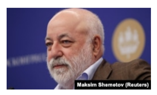
Ruský podnikatel Viktor Vekselberg (souborové foto)