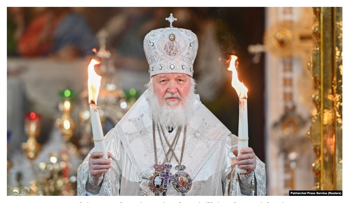
Ruský pravoslavný patriarcha Kirill (souborové foto)

Evropská unie upustila od kroku uvalit sankce na vůdce ruské pravoslavné církve patriarchu Kirilla, aby zajistila, že Maďarsko přijme poslední balíček opatření bloku proti Rusku za jeho nevyprovokovanou invazi na Ukrajinu.